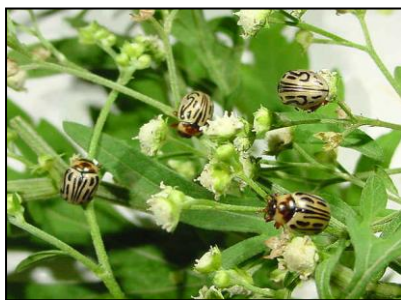
Zygogramma bicolorata bimaculatus