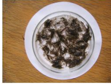
Fig(2) samle of plants.