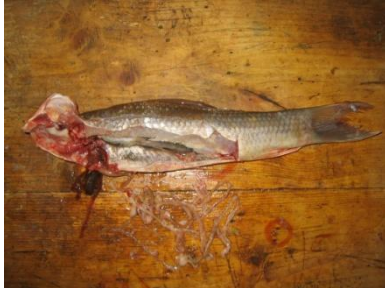
Fig(3) digestive of labeo niloticus .