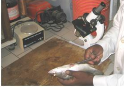
Fig(1) methods of fish anatomy.