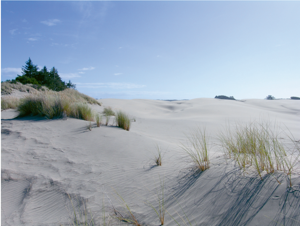
Fig 20. The Oregon Dunes, Baker Beach, type locality of Granuliphorura pomorskii sp. n. and Friesea oregonensis sp. n.

respectively. Subcoxae I, II, III with 0, 2, 2 chaetae respectively. Claws without inner tooth (Figs 16-17). Empodial appendage absent.