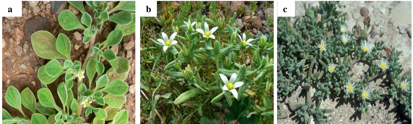
Figure 1. Aizoon canariense (a), A. hispanicum (b) and Mesembryanthemum nodiflorum (c), commonly named ghassoul or taghassoult .

attitude leading to the multiplication of the number of taxa. Thus, for example, the family of cacti, would count, in the world, 30 to 50 genera and about 1000 species, or about 200 genera and over 2000 species. The differences are much wide, and several other families experience the same situation.