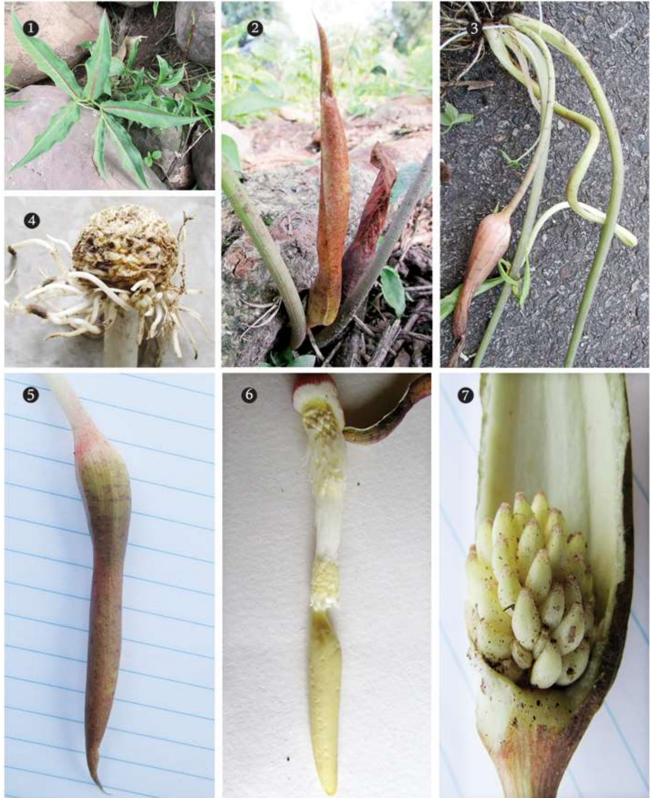
Fig. 2. 1. Plant habit in in-situ. 2. Plant with young inflorescence. 3. Uprooted entire plant, roots, tuber and mature inflorescence. 4. Wrinkle globous white tuber with white thick roots. 5. Young inflorescence. 6. Spadix, distal zone is female, sterile middle zone with staminodes, male part below appendix and above middle sterile zone and distal part is appendix. 7. Young fruit.