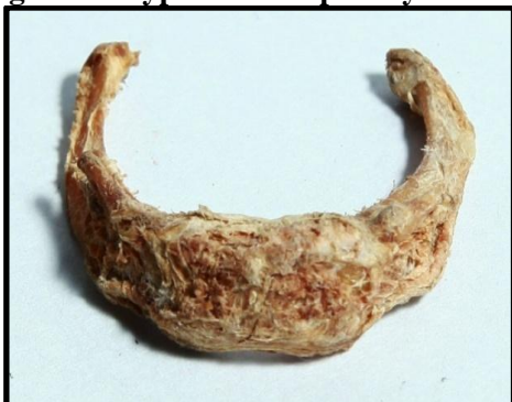
Figure-1: Hyperbola shaped Hyoid Bone

diameter of the bone is the base of the triangle.