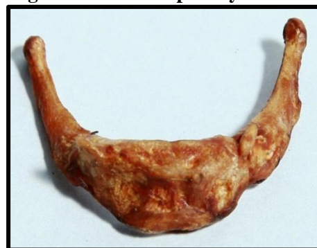
Figure- 4: Boat shaped Hyoid Bone

All the above mentioned four types are further sub classified as symmetrical and asymmetrical. The frequency of types of shape is shown in Table 1.