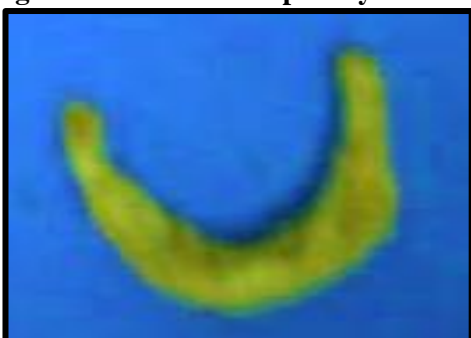
Figure-2: Parabola Shaped Hyoid Bone