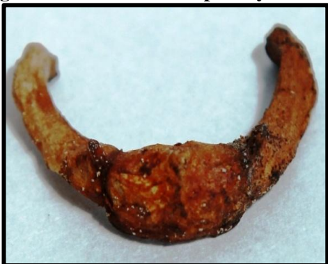
Figure-3: Horse-shoe Shaped Hyoid Bone