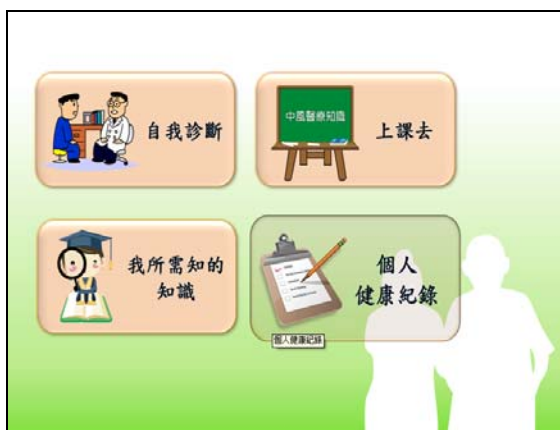
Figure 1. The user interface sketch of stroke-precaution HSS.

The gender digital divide exist in using ICTs course for learning. Female citizens have stronger wills and higher proportion that using ICT course for learning. Previous studies [16, 17] also provide similar outcome that female learn things more than male user, especially for the elderly senior citizens.