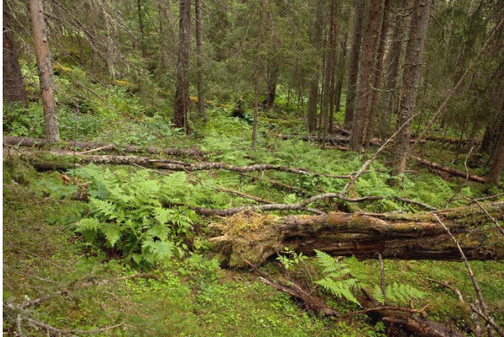
Spruce forest

One also finds acid coniferous forests with Vaccinium myrtillus and a rich mycota of the subgenus Telamonia . The swampy forests and the marshes also host a special Cortinarius funga.