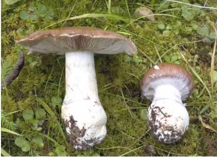
Cortinarius blattoi