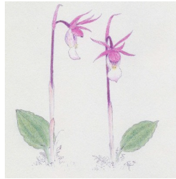
Calypso bulbosa Water colour by Rolf Lidberg