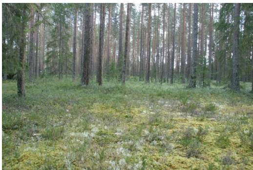
Sandy pine forest

The boreal, sandy forests with Pinus sylvestris were created by the latest glaciation. They contain a specialised and interesting mycota with species such as Cortinarius leucophanes , C. pinophilus , C. phrygianus , and C. quarciticus . Also an edible and delicious mushroom grows here, the precious Tricholoma matsutake , as well as many Dermocybe , excellent for dyeing.