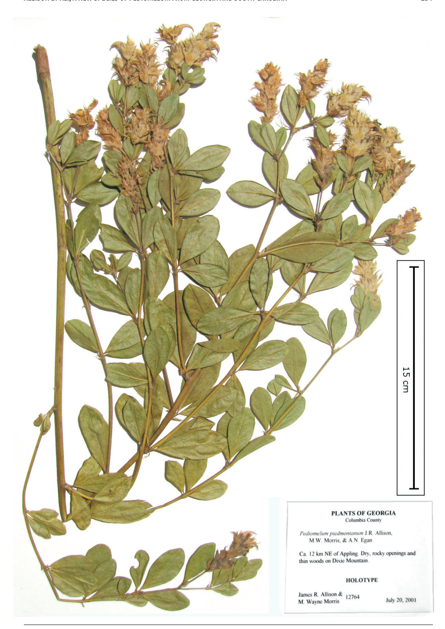
Fig. 2. Holotype of Pediomelum piedmontanum , prior to its deposit at NY.