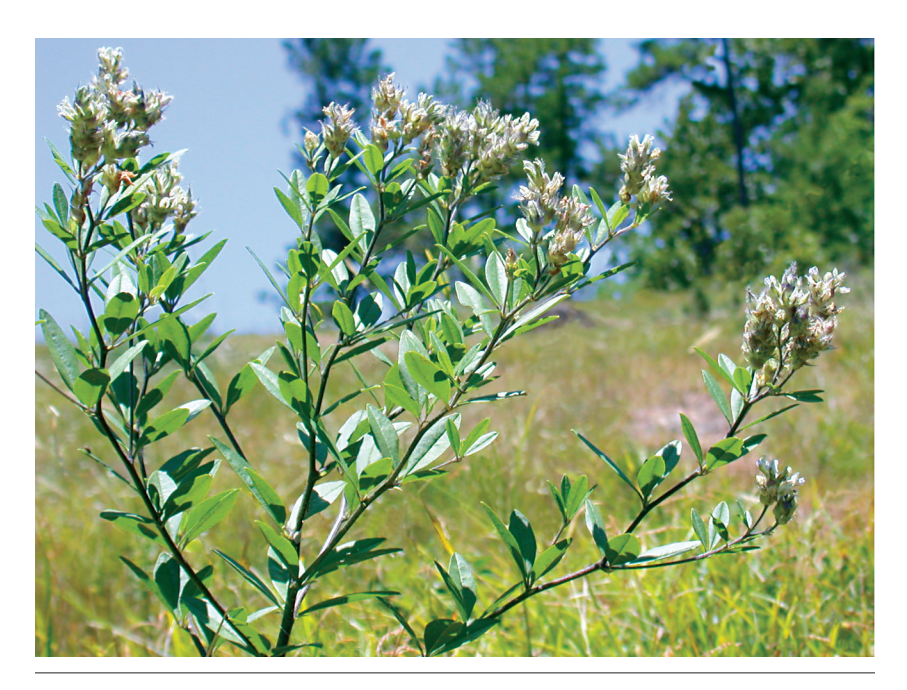
Fig. 1. Upper portion of a plant of Pediomelum piedmontanum , with the characteristic dense, many-flowered inflorescences and leaves all more than twice as long as wide. Columbia County, Georgia, 15 Jun 2002.

Inter species Pediomeli subgeneris Pediomeli sensu Grimesii petiolis brevioribus quam petiolulis ad P. canescens solum accedit, autem simul est P. reverchonio soli simile bracteis floralibus magnis et latissimis et valde caudatis, sed ab ambobus statim distinguitur inflorescentiis densis et multifloris.