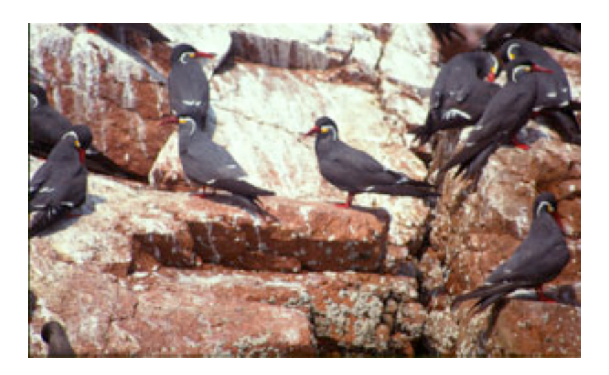
Inca Terns on Islas Ballestas

cost. After 1 hour or so we got 2 Peruvian Diving-Petrel close by. Big waves this far out, we were splashed sometimes when the boat driver couldn't avoid a head-on collision with a big wave. Back in harbour at 10:15.