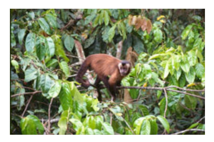
White-fronted Capuchin Cebus albifrons A total of 40 MWC 20-23.11.

11 Cock-of-the-Rock Lodge 11.11 and a total of 47 MWC 17-23.11.