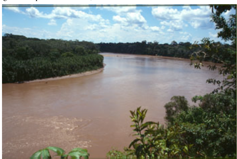
View of Manu River from MWC

building up. At 18:00 we reached the boat. 200 Sandcoloured Nightjars were sitting on a narrow sandbar at the lodge at dusk, all taking off at the same time. Nice with some beer and whisky in the evening after a sweaty day. 610 species so far on the trip, I've had 449 new lifers, very good.