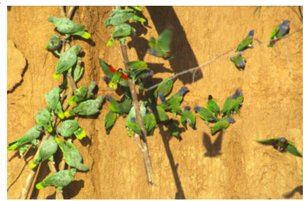
they eat. Three species of smaller parrots arrived first; Mealy, Orange-cheeked and Blueheaded.

Then there was a pause for 30 minutes, we got breakfast in the floating hide while waiting, and then 60 Red-and-green Macaws arrived at 8 o'clock together with a few Scarlets. Even some Piping-Guans were eating clay. The rest of the morning was spend on the ox-bow lake Cocha Camungo in sunny and nice weather. Still no signs of Giant Otter (which we dipped on this trip). We also birded from a clearing nearby for a while.