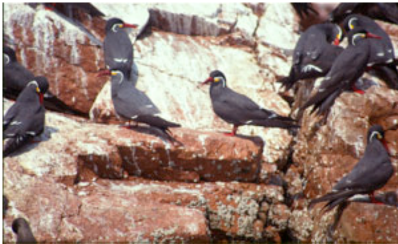
Inca Terns on Islas Ballestas

cost. After 1 hour or so we got 2 Peruvian Diving-Petrel close by. Big waves this far out, we were splashed sometimes when the boat driver couldn't avoid a head-on collision with a big wave. Back in harbour at 10:15.