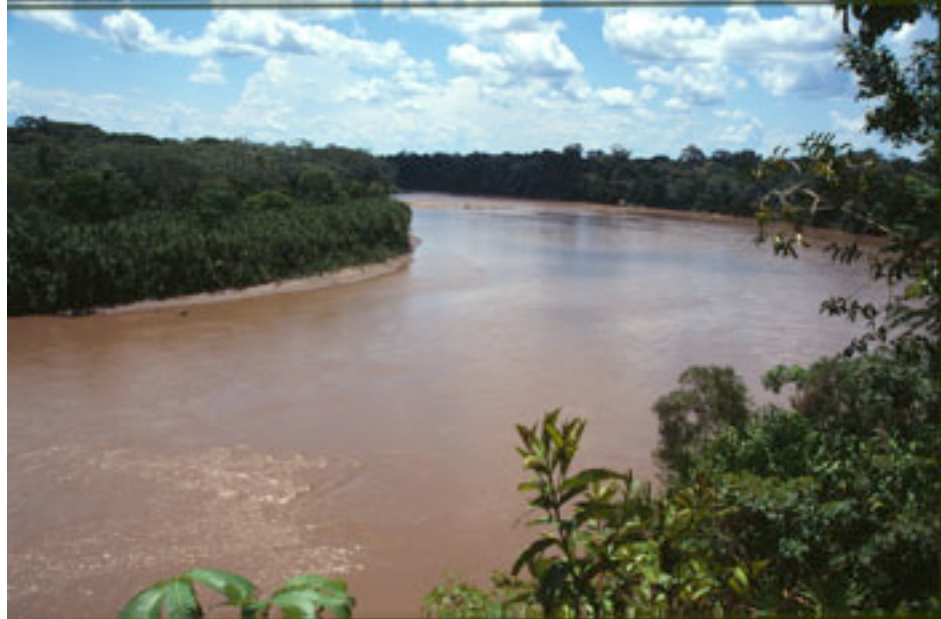
View of Manu River from MWC

18:00 we reached the boat. 200 Sand-coloured Nightjars were sitting on a narrow sandbar at the lodge at dusk, all taking off at the same time. Nice with some beer and whisky in the evening after a sweaty day. 610 species so far on the trip, I've had 449 new lifers, very good.