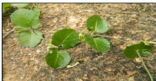
Ceropogia bulbosa (Asclepiadaceae)