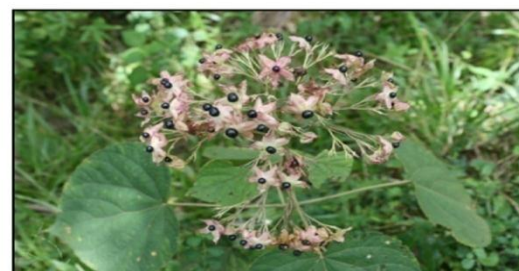
Clerodendrum infortunatum (Verbenaceae)