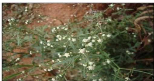
Parthenium hysterophorus (Asteraceae)