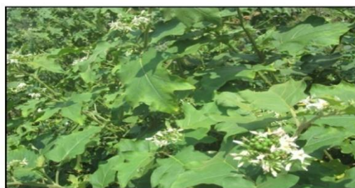
Solanum torvum (Solanaceae)