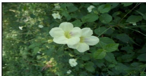
Asystasia gangetica (Acanthaceae)