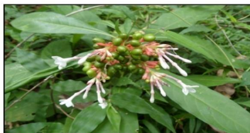
Rauwolfia serpentina (Apocynaceae)