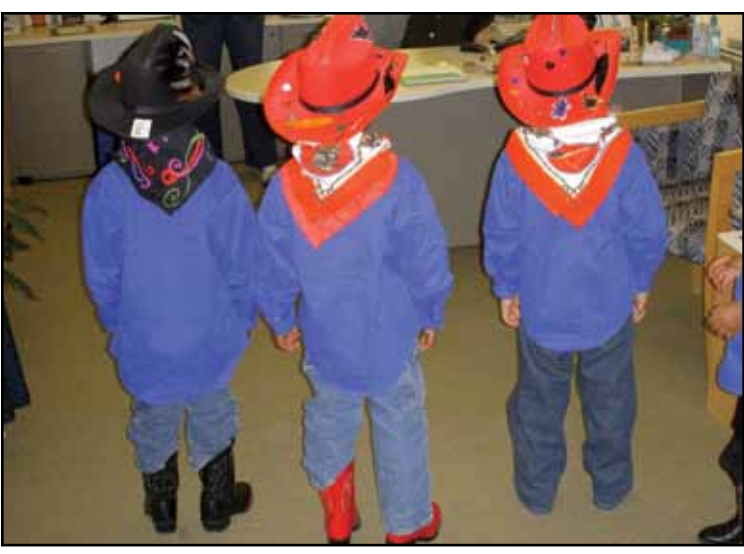
Kempe Therapeutic Preschoolers show off their cowboy gear in celebration of the National Western Stock Show.