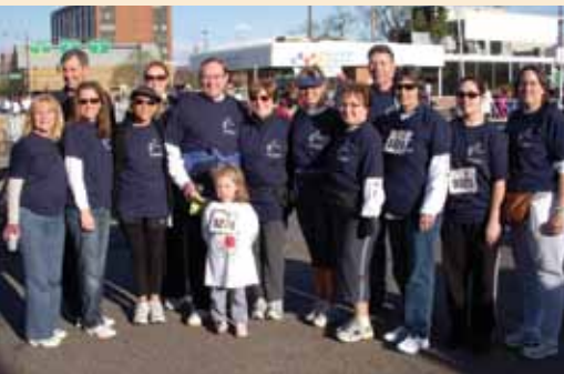
Race participants from three Kempe pledge teams and Kempe staff at 2010 Cherry Creek Sneak.

Lace up your shoes and help Kempe stop child abuse! To donate or pledge, visit www.active.com/donate/kempe .