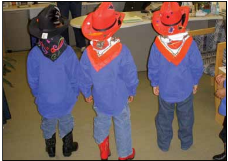
Kempe Therapeutic Preschoolers show off their cowboy gear in celebration of the National Western Stock Show.