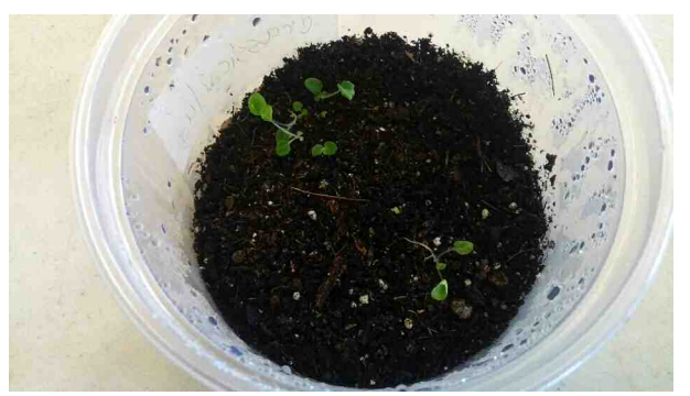
B. crassicaulis (see below)