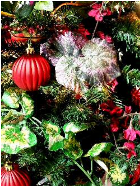
Details on the 2019 AABS Christmas tree