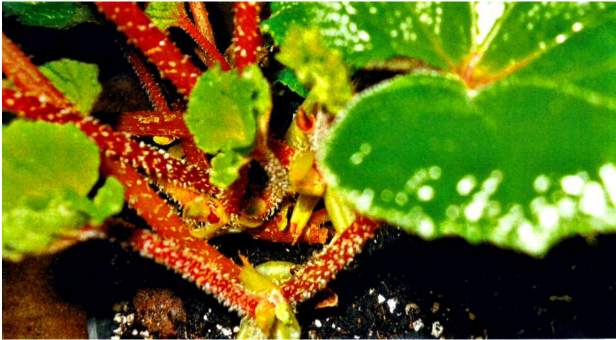
BEGONIA 'MAURICE AMY'