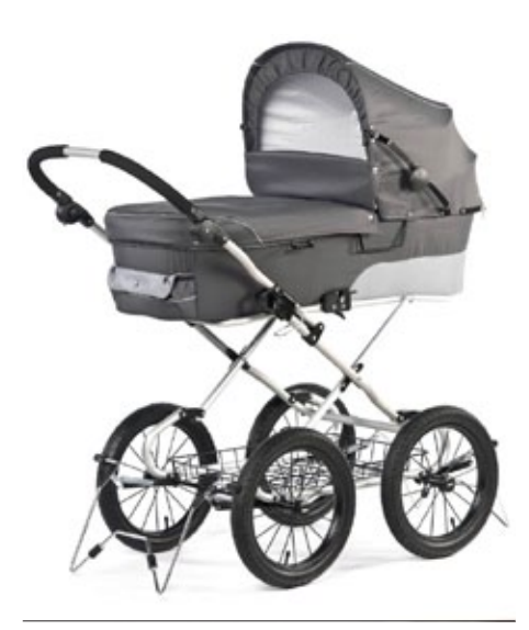
DARK GREYLIGHT GREY