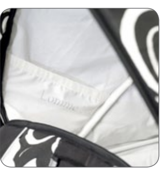
POCKET IN HOOD