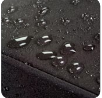
WIND AND WATERPROOF EXTERIOR