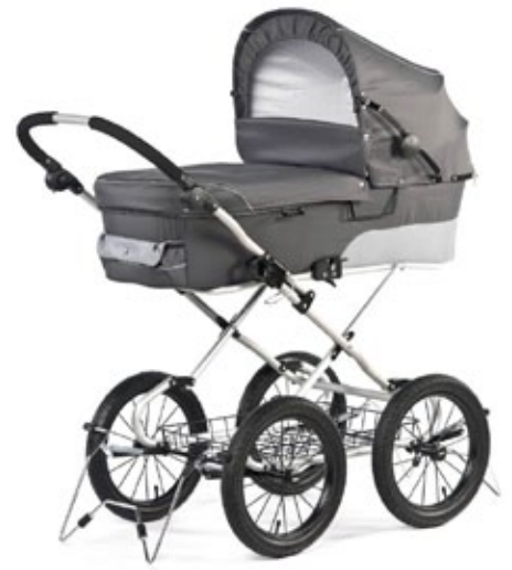
DARK GREYLIGHT GREY