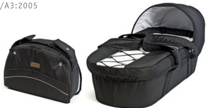
DIAPER BAG AND CARRYCOT