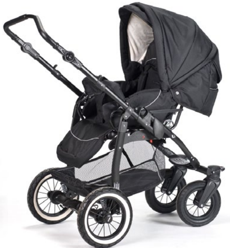
FRAME WITH SEAT