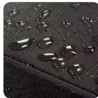
WIND AND WATERPROOF EXTERIOR