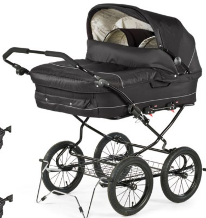
TRILLE TWIN WITH 2 CARRYCOTS