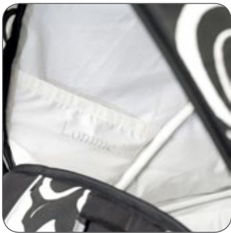
POCKET IN HOOD