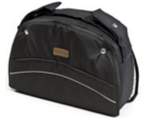
DIAPER BAG AND CARRYCOT