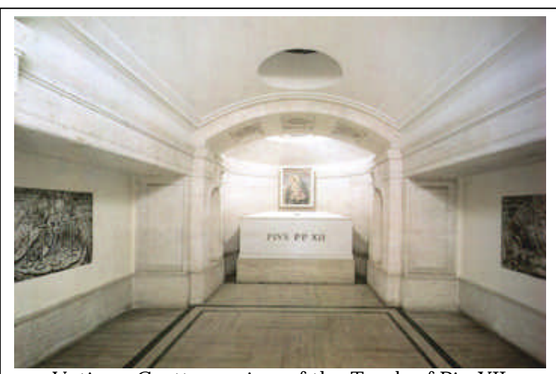
Vatican Grottoes, view of the Tomb of Pio XII