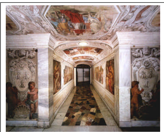
Vatican Grottoes, facing the peribolus of St. Andrea's Chapel

The continuous work of about 10 restorers from the EdilRestauri, coordinated and directed by expert technicians from the Fabbrica di San Pietro, was needed to carry out the restoration of a pictorial surface of