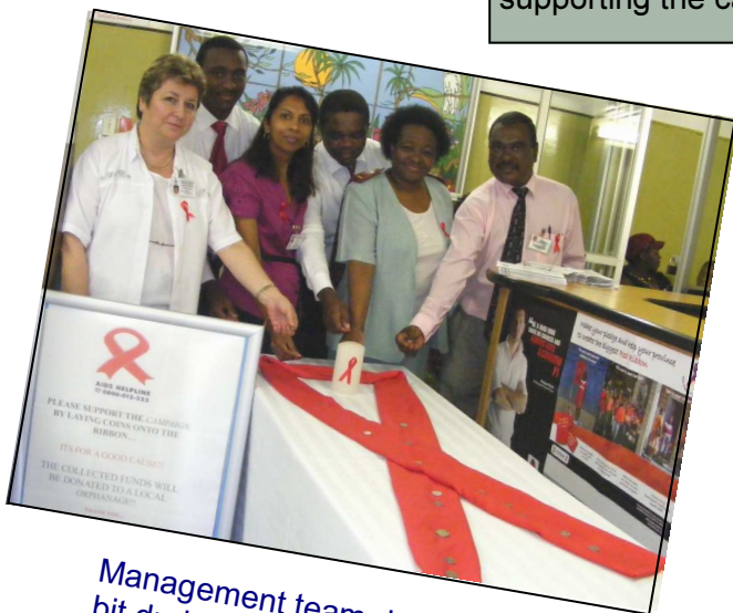
Management team doing their bit during the coin-laying!