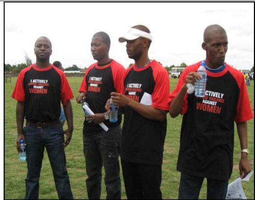
AMADODA ANGEMPELA AWABHLUKUMEZI