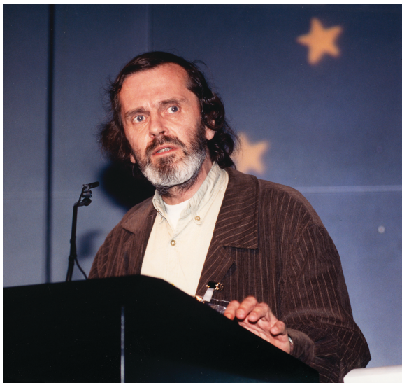
Erkki Kurenniemi. 1990s.

While we wait for 2048, the year of Kurenniemi's rebirth, his archive lives a life of its own. It will only provide some limited answers to the questions posed by researchers. These answers cannot be predetermined, just like it is not possible to tell which questions will be asked or how the archive is interpreted at any given time. As the ink on the receipts and printouts fade and the floppy disks become unreadable, a public institution continues to do its best to preserve Kurenniemi's vision, an ephemeral art.