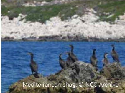
Mediterranean shag