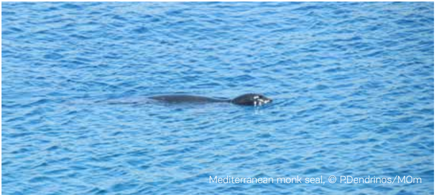
Mediterranean monk seal

The Mediterranean monk seal is a species that is regularly observed at Andros Island. It hunts in the sea surrounding the island and rests in its marine caves. The neighbouring Gyros Island hosts the largest species population in the Mediterranean Sea. It is the rarest seal on Earth.