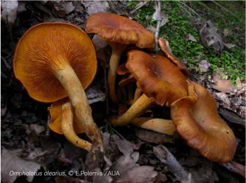
Omphalotus olearius

shrubs that commonly host a wide variety of mushrooms are the pink rock-roses ( Cistus spp.), heathers and strawberry trees.