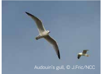
Audouin's gull, © J.Fric/NCC