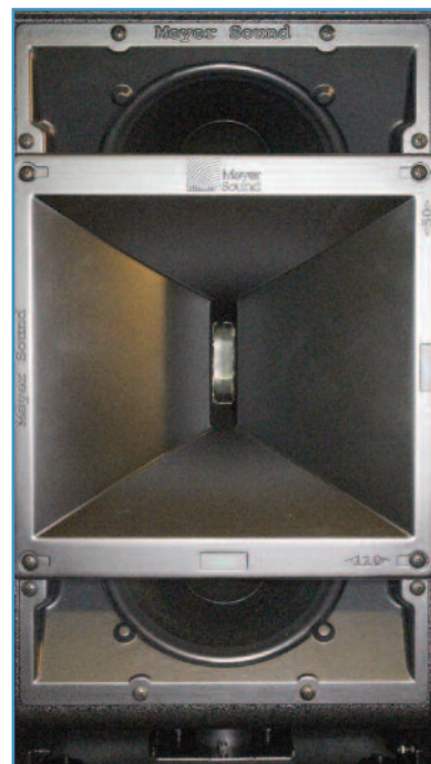
Low-frequency and high-frequency concentric driver configuration.

powder-coated black. Custom color finishes are available as well. Four screws (two top, two bottom) hold the front grille in place to facilitate easy access for rotating the horn. Another