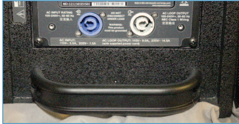
Lower handle and AC input.

The Ultra-X40 is named as an acknowledgement of the 40th anniversary of Meyer Sound (the product was introduced in 1979, the company was