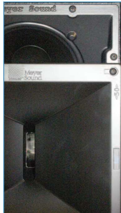
Horn orientation and indication for 50° vertical coverage.

The enclosure is manufactured of multiple-ply birch wood and is finished with black textured paint. The front grille is made of perforated steel and