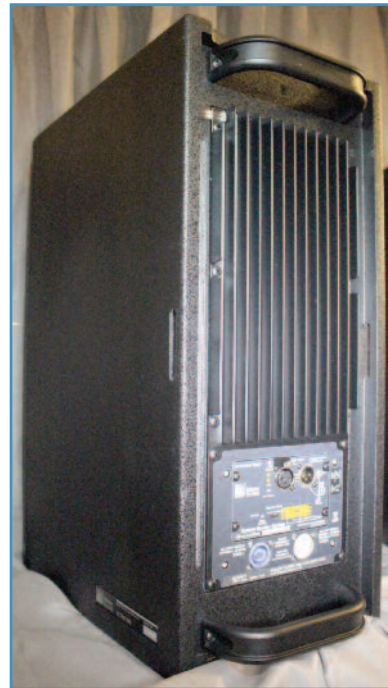
ULTRA-X40 rear. (Note handles at top and bottom and the water drainage slots back-mid of the cabinet, on either side of the amplifier.)