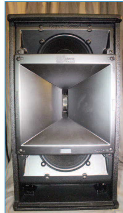
Front grille removed and rotatable horn exposed.

founded in 1979), and it is part of the Ultra series of loudspeakers.