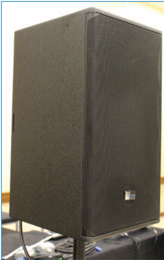
Pole mounted for event sound system.

four screws hold the horn. The screws can be removed, and the horn rotated clockwise to change the coverage to 110° vertical and 50° horizontal. About midway on the side and back of the cabinet are two “slots” that help facilitate water drainage in wet weather, when using the weatherproof version of the speakers are oriented horizontally.