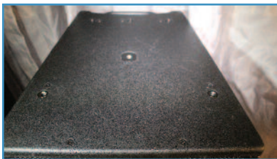
Top rigging points.

operating frequency range of 55Hz — 19.5kHz. Linear peak SPL is 132.5dB with an 18dB crest factor, measured using Meyer’s M-Noise (130dB with pink noise).