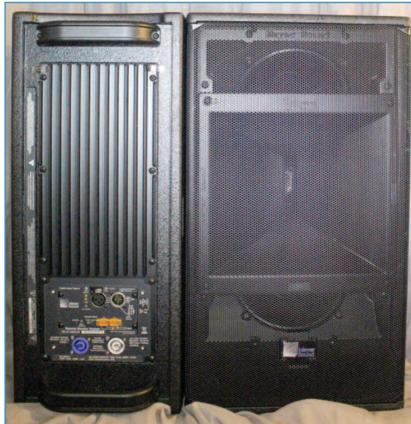
Front and rear of ULTRA-X40.

I finally saw an ad and notified my colleagues. I contacted the company and requested a demo system. Their closest dealer at the time was in Austin, Texas, so it was arranged and four UPA-1s and two USW subs were