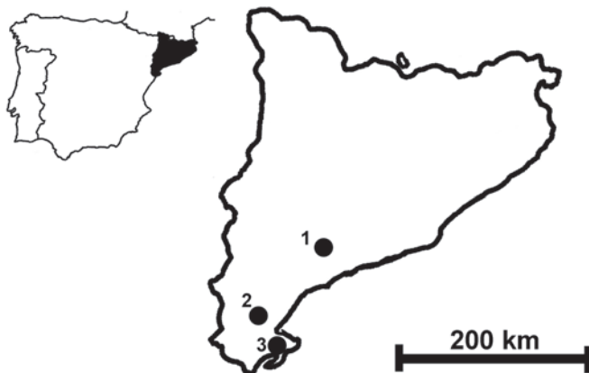
Figure 1. Location map of the studied localities of Stagnicola in Catalonia (right), and situation of the latter within the Iberian Peninsula (left). Legend: 1, Espluga de Francolí, shores of the Francolí River; 2, Tivenys, shores of the Ebro River; 3, Amposta, rice fields (Ebro Delta).

Our results therefore suggest that the true identity of most, if not all, Catalan populations of genus Stagnicola might correspond to S. fuscus . Specimens of the Francolí River (La Riba) were attributed to S. palustris by Bech (1990), and the same applies to specimens from the Ebro Delta reported by Escobar (1985) and Bros & Bech (1989).