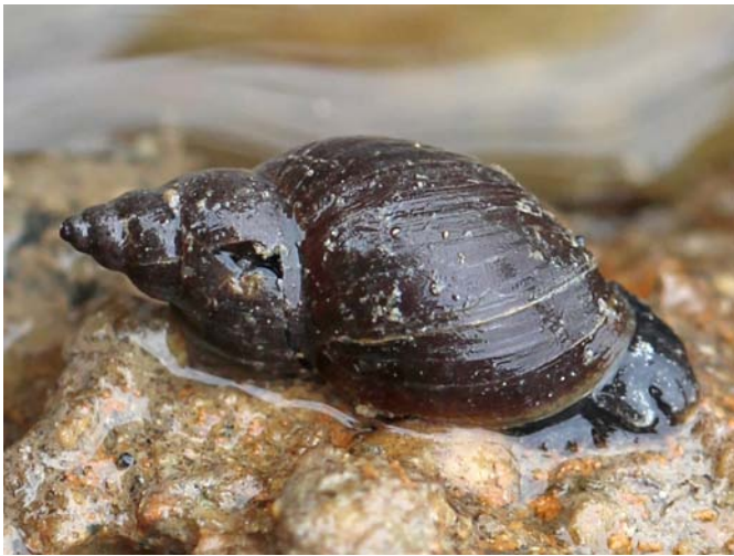
Figure 2. Alive specimen of Stagnicola fuscus from Amposta.