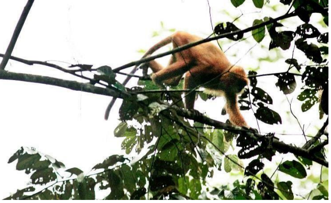
Maroon Leaf Monkey