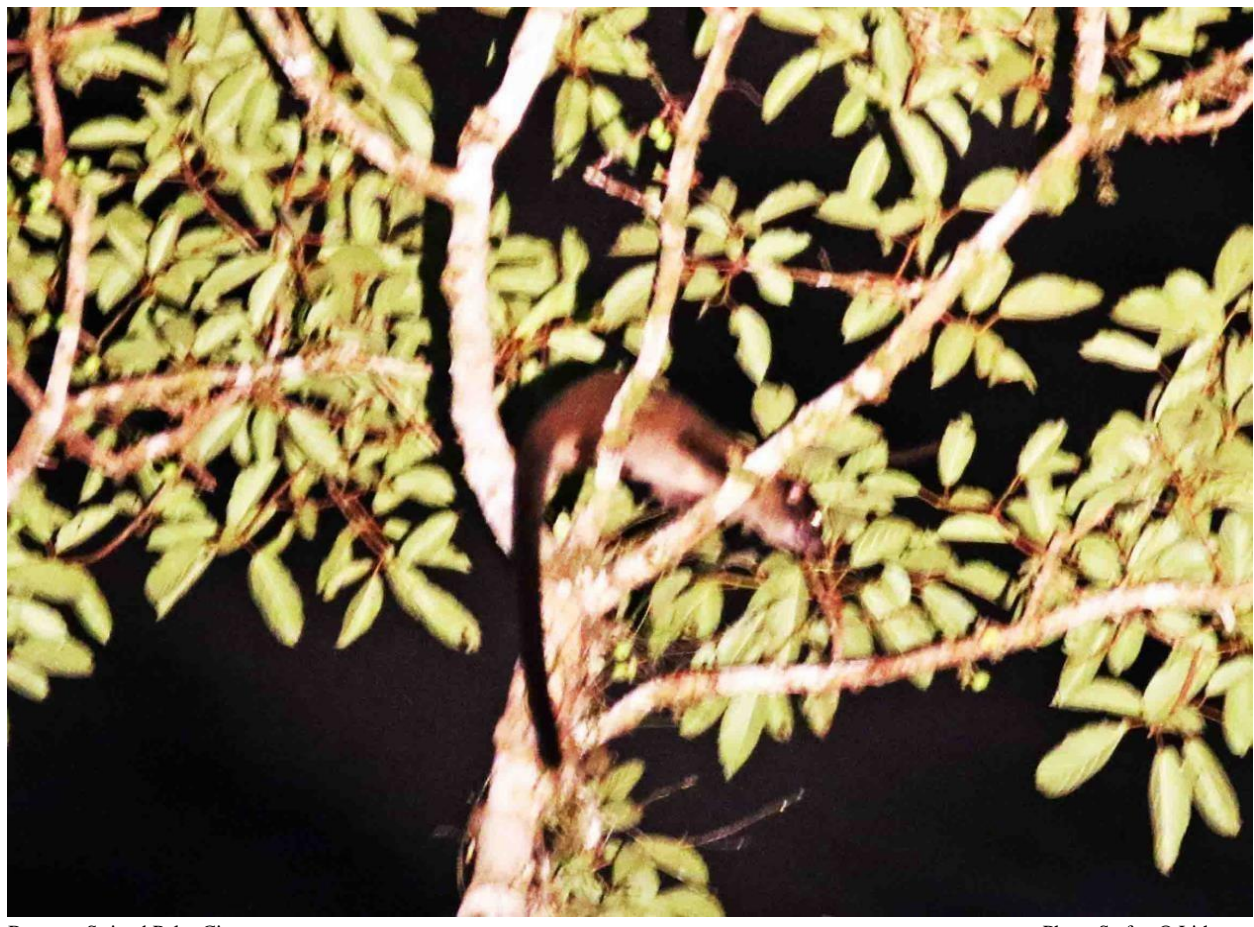
Bornean Striped Palm Civet

According to Phillipps this large very dark brown rat with an even darker tail, slightly longer than body (HB) is common and often seen foraging along stream- and river banks.