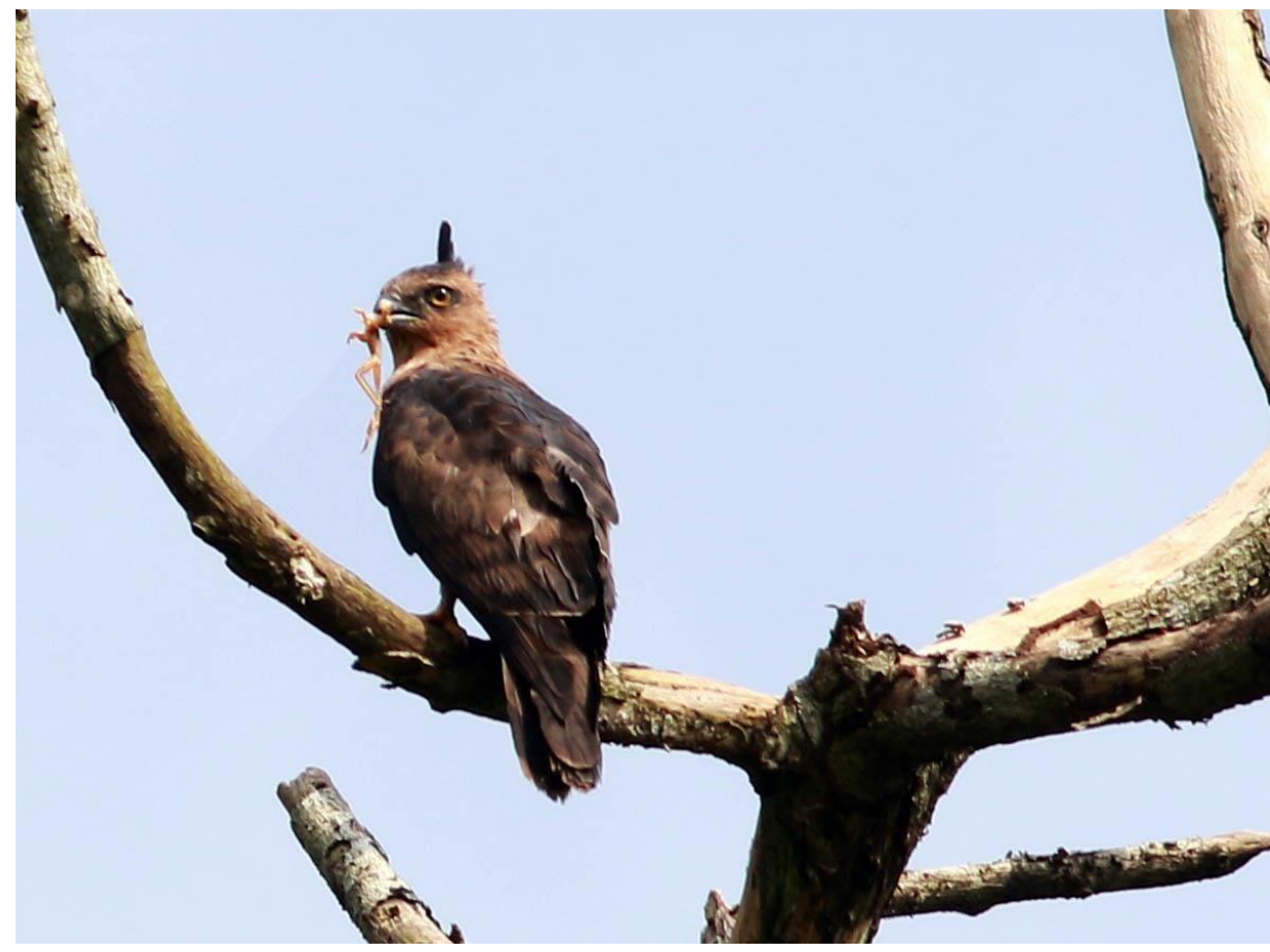
Jerdon's Baza with lizard

Zanclostomus javanicus Phaenicophaeus curvirostris Carpococcyx radiatus Centropus sinensis bubutus Hemiprocne longipennis harteti Hemiprocne comata comata Collocalia affinis cyanoptila