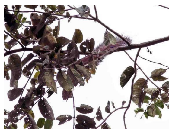
Bornean Black Banded Squirrel