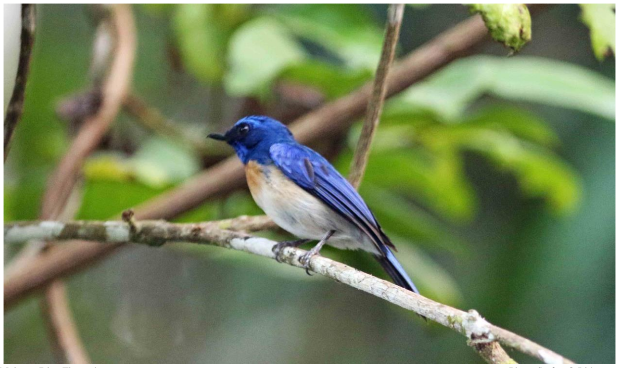
Malayan Blue Flycatcher

Green Broadbill Hose's Broadbill Whitehead's Broadbill Dusky Broadbill Black-and-red Broadbill Banded Broadbill