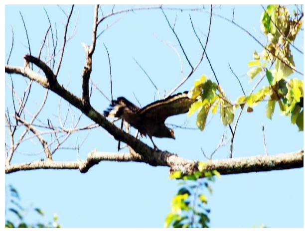
Bat Hawk