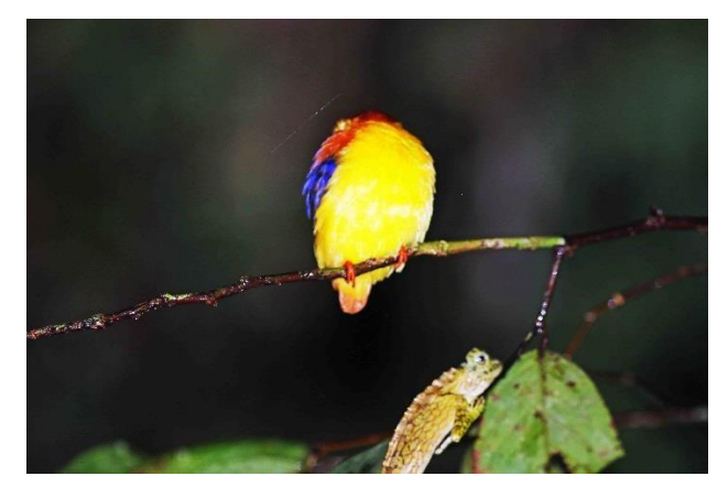
Rufous-backed Kingfisher sleeping