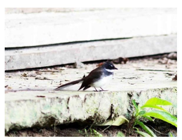
Malaysian Pied Fantail