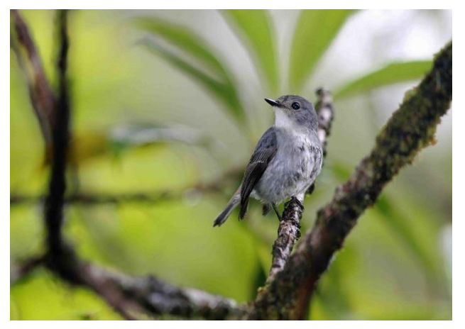
Little Pied Flycatcher (female)