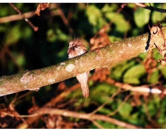
Large Frogmouth Blyth's Frogmouth Photo Stefan © Lithner