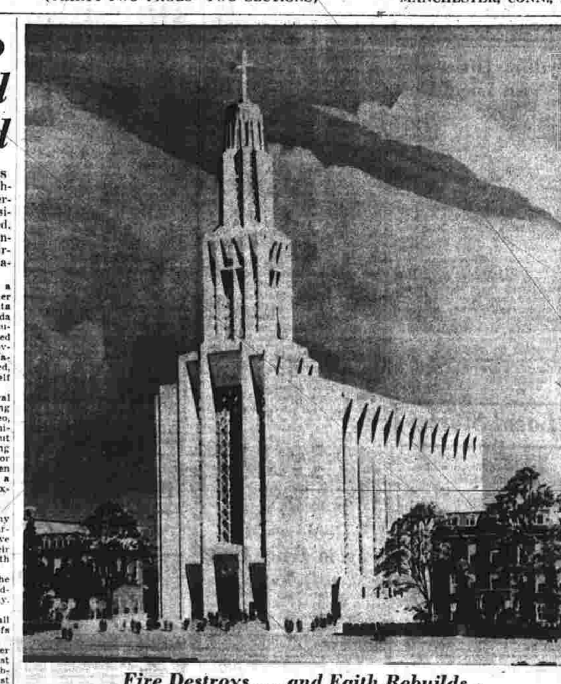
Fire Destroys . . . and Faith Rebuilds

By THE ASSOCIATED PRESS Unconfirmed reports reaching Amsterdam, The Netherlands, said Indonesian President Sukarno had been ousted. The reports caused wide confusion in Dutch business circles. There was no confirmation.