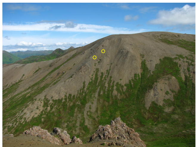
Fig. 3. Active Kittlitz's murrelet nests discovered on an unnamed peak on Kodiak Island, Alaska, in 2008 (right circle) and 2010 (left circle; nest on issue cover). Distance between nests was 45 m. Proximity of these nests to vegetated alpine terrain was typical of nests discovered during this study.

To identify the habitat characteristics of searched areas that were not used by nesting Kittlitz's Murrelets, we collected habitat data for randomly assigned plots at two different spatial scales: near the site of each active nest and across the entire study area. To identify characteristics of habitat near nest sites, we assigned two "near-nest" plots at a random bearing and distance (50–150 m) from each active nest site. Near-nest plots were limited to locations that had been searched during the study year in which the nest was found and were constrained to fall \geq 50 m from each other to ensure representative sampling of the area. We generated random numbers to determine bearing and distance from nest sites to near-nest plots and used handheld GPS units to confirm that near-nest plots fell within our nest-search area. To identify habitat characteristics