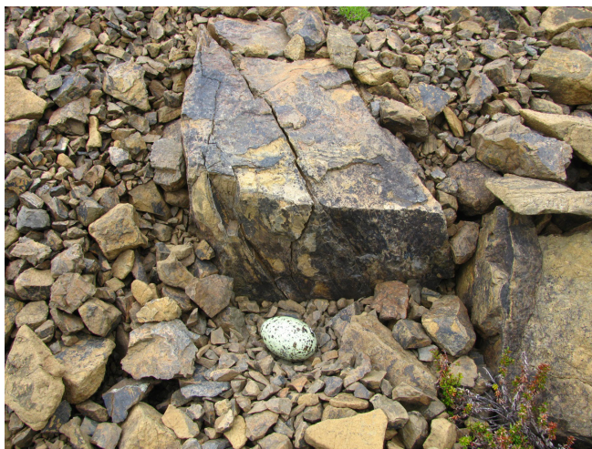
Fig. 2. Kittlitz's Murrelet nest site, Kodiak Island, Alaska, 16 June 2011. This nest was typical among those discovered during our study: the scrape was composed mostly of rocks 1–5 cm diameter and was located immediately downslope of a moderate-sized rock; this particular nest rock was 24 cm diameter. Photo credit: M.J. Lawonn/USFWS.

We collected data on nest-site characteristics at each nest once nesting activity had ceased, typically in late July to mid-August. We collected data each year for nest sites used in multiple study years and treated them as separate nests for analysis. We measured nest dimensions and classified the type and composition of substrate in and adjacent to each nest site. We measured slope aspect at the nest site with a handheld compass. We measured slope pitch to the nearest degree with a clinometer; slope was measured for a 10-m long line segment that extended 5 m above and 5 m below the nest. Nest-site locations were recorded with a handheld GPS, and elevation of the resulting waypoints was obtained from a raster-based digital elevation model with a 10 m resolution in ArcGIS 10. Visibility of the ocean from the nest was determined from a standing position at the nest site and was categorized as either visible or not visible.