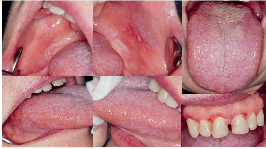
Fig. 1: Presence of multiple white papular lesions with reticular arrangement and atrophic-erythematous, erosive-ulcerative and plaque lesions. Bilateral and symmetric distribution. Clinical diagnosis of Oral Lichen Planus.

The "white papule" is the characteristic diagnostic clinical lesion of OLD, usually "linear" and with a "reticular" arrangement, that must always be present in order to make its clinical diagnosis (8) (Fig 1, Fig. 2, Fig. 3).