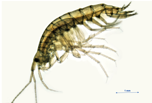
Crangonyx pseudogracilis , from Warnham Reserve 26-Nov-2017

If you look up freshwater shrimps in most guides to UK freshwater life you will most likely find Gammarus pulex as the common cited species, at least in southern England. Since the 1930s another very similar invasive alien has established itself in the UK, Crangonyx pseudogracilis . To the casual observer the two species are almost indistinguishable, however, if you watch a shrimp walking over a stone G. pulex moves on its side, whereas C. pseudogracilis walks upright. Microscopically, they can be distinguished by their tail parts or uropods, which are distinctive. I recently obtained water samples from the wetland at Warnham Local Nature Reserve, here in Horsham, West Sussex, taken from a starwort filled channel that had been cut under a boardwalk and found an abundance of C. pseudogracilis . Going back over my older records, I realise I had prepared a permanent mount of C. pseudogracilis from the Reserve back in 2015, mistakenly identified as G. pulex .