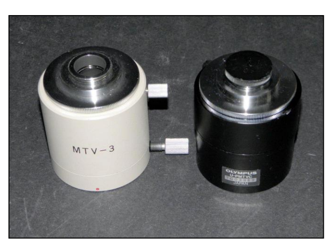
Figure 9. MTV-3 and U-PMTVC c-mount connection tubes for BH2 head flanges.

The U-PMTVC tube is a connector with a c-mount end and attaches to either a BH2 or BX microscope. An Olympus or after-market infrared remote is very useful to control shutter and zoom.