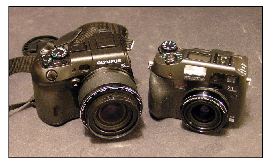
Figure 13. Olympus Camedia cameras C-8080 (left) and C-7070 (right).

These cameras had street prices of $800 to $1100 when new, but now (early 2013) even when in great condition go for $90 to $160 on eBay (the C-7070 is a little scarce). A fault such as a bad flash or cosmetic damage can make the camera much cheaper but still OK for our purposes. I like the C-8080 although it is unsuitable for photo-microscopy, so I will keep it to use as an outdoor camera.