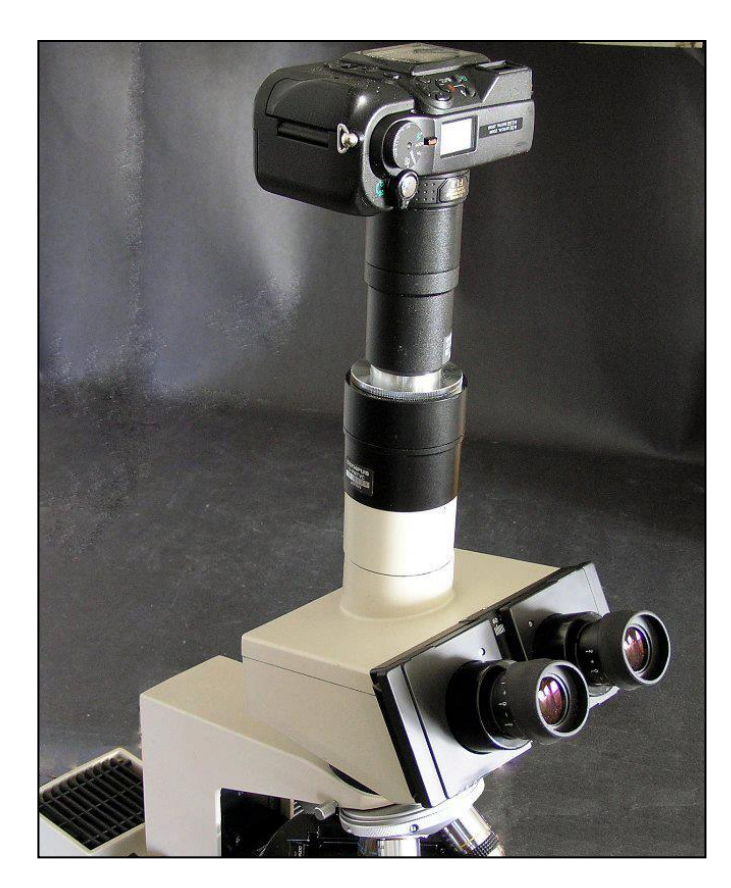
Figure 12 (right). On my BX50 microscope, a Camedia C-5050 (5 megapixels) is attached to a C3040-ADU relay adapter and U-CMAD-2 plus U-TV1x tubes.

The C-5050 camera features a flip-up LCD screen for easier viewing to focus, but in fact it is parfocal with the eyepiece view anyway. A small RM-2 infrared remote shutter release is attached with velcro next to the left eyepiece tube, so I don't need to look up from the viewing to snap a photo. The video-out cable is attached to an old laptop nearby to allow quick reviews of images (not a live view, unfortunately).