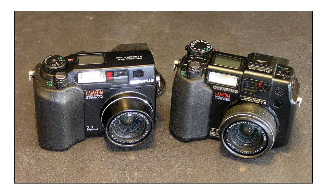
Figure 6. Olympus Camedia C-3040 (left) and C-5050 (right) cameras.

The C3040-ADL camera adapter was designed for BH2 160 mm optics, so for the BX infinity optics a version called C3040-ADU was made. Newer Olympus camera models C-5060 and C-7070 (5 and 7 mp) use a larger 48.5 mm lens thread, so for them the C5060-ADU adapter appeared (Fig. 7). These later adapters have sections that come apart and can be adjusted to make the camera parfocal with the viewing focus. Separate photo relays are not used with the -ADU versions on BX microscopes, but the original -ADL needs a relay eyepiece on the BH2, inserted under the c-mount connector.