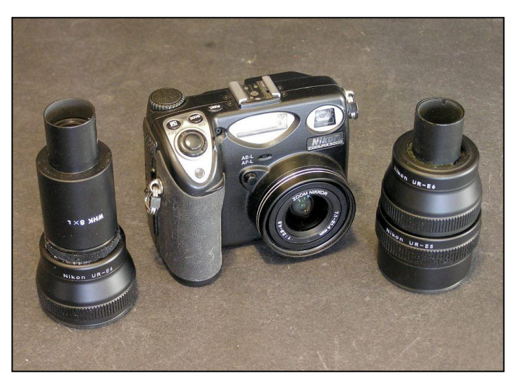
Figure 4 above. Nikon Coolpix 5000 with connectors. Figure 5 right. Nikon CP5000 mounted on a BH2.

addition of a UR-E5 adapter (right adapter) allows a newer Olympus 30 mm eyepiece to be inserted inside the adapter assembly and also leaves room for the zoom lens to extend. This is good for many stereoscopes.