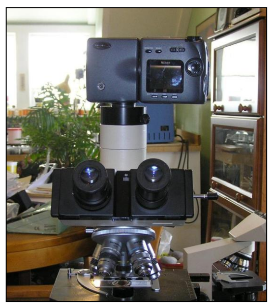
Figure 3. CP990 with a Zarf adapter, also housing a Zeiss 8x relay eyepiece.

A very nice adapter with a 28 mm thread for these older Nikon Coolpix models is made by Zarf Enterprises especially for the trinocular BH2 head (Fig. 3). It is just a connector, no lens, so an eyepiece relay lens must be used as well (not a film-camera photo relay lens). You need one with a fairly shallow upper body to fit under it. Unfortunately the best one for the purpose -- the Olympus WHK 8x -- is too big to fit well with this adapter. The next best eyepiece relay lens is a Zeiss 8x Kpl, at least in my experience.