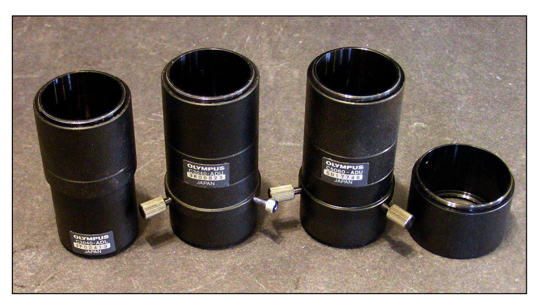
Figure 7. Olympus screwon adapters for particular Camedia camera models.

The C3040-ADL camera adapter was designed for BH2 160 mm optics, so for the BX infinity optics a version called C3040-ADU was made. Newer Olympus camera models C-5060 and C-7070 (5 and 7 mp) use a larger 48.5 mm lens thread, so for them the C5060-ADU adapter appeared (Fig. 7). These later adapters have sections that come apart and can be adjusted to make the camera parfocal with the viewing focus. Separate photo relays are not used with the -ADU versions on BX microscopes, but the original -ADL needs a relay eyepiece on the BH2, inserted under the c-mount connector.