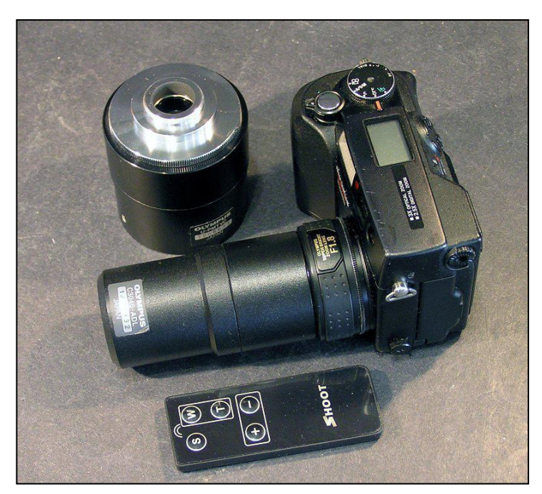
Figure 8. Olympus adapters with a Camedia C-4040 camera.

In recent years I have collected quite a few of the accessories and appropriate cameras by Olympus for use in photomicroscopy. The C3040-ADL adapter tube is screwed onto the filter thread of the C-3040 or later cameras of that series (in Fig. 8 it is a C-4040). This adapter has a projection lens that matches BH2 Olympus optics perfectly, and I also expect it will out-perform non-Olympus adapters (I have no proof however).