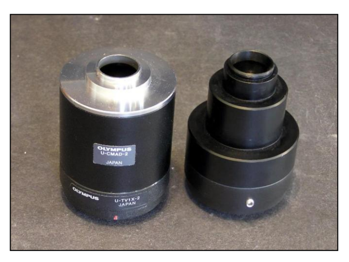
Figure 10. U-CMAD-2 and U-CMAD-3 c-mount connection tubes for BX heads.

The camera adapter C3040-ADL requires a C-mount at the microscope head end, which is not standard for BH2/BX trinocular heads. The MTV-3 and U-PMTVC attach to the head's photo tube to provide the male c-mount thread (also used for video or TV cameras). They fit over an eyepiece projection lens --I often use a Zeiss 8x Kpl for my consumer cameras. Both adapters seem to work the same on a BH2, each with a 0.3x reducing relay lens.