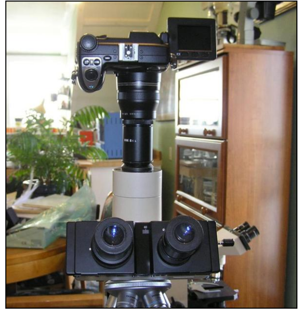
Figure 5 shows the Nikon CP5000 mounted on a BH2 with its 8x eyepiece and adapter, and view screen rotated. Not many controls are easily accessed (the ones on the camera top). In addition, you might want Nikon accessories such as power adapter, wired remote control, and USB computer cable. These are all available on eBay.

Their special microscope camera systems were (and are) very expensive, but Olympus also developed adapters for some of their consumer point-and-shoot digital cameras. The first adapter was called C3040-ADL, named after the Camedia C-3040 3.34 MP camera (Fig. 6). The same 41 mm filter thread continued on the C-4040 and C-5050 models (4 and 5 megapixels), and those are also excellent microscope cameras. The later models also have flip-out LCD view screens, which are very useful high above a microscope head.