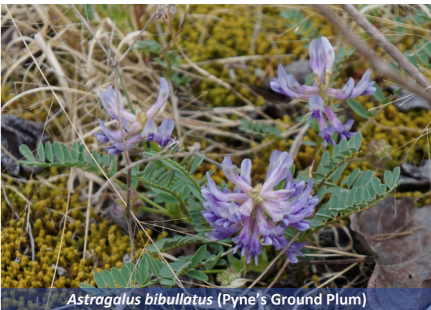
Astragalus bibullatus (Pyne's Ground Plum)