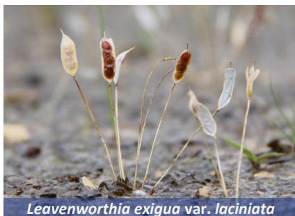
Leavenworthia exigua var. laciniata

The Center for Plant Conservation (CPC) is a consortium of botanical institutions working to safeguard imperiled species from extinction. As a member of CPC, we seed-bank over 40 rare taxa in the South-eastern US. This past year we collected seed of 11 species in 6 states: Here are some of the highlights: