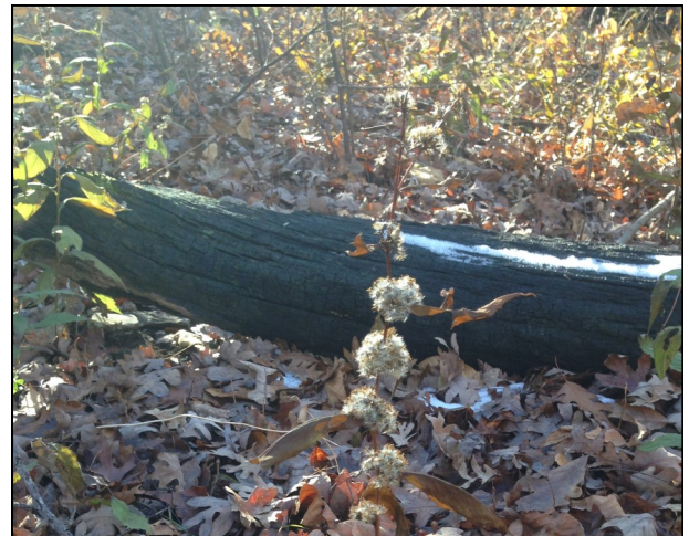
Solidago ouachitensis with mature seed. A charred log in the background provides evidence of recent fire.