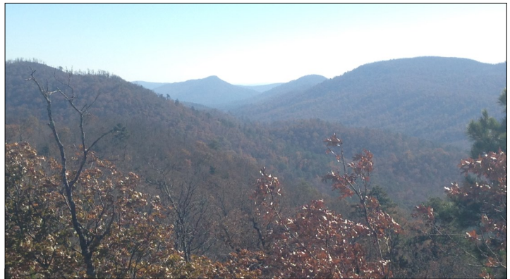
The ruggedly scenic Ouachita Mountains of Arkansas and Oklahoma host many endemic plant taxa, including Ouachita mountain goldenrod ( Solidago ouachitensis ).

The Center for Conservation and Sustainable Development (CCSD) at the Missouri Botanical Garden (MBG) works to conserve global biodiversity. Within the US, we take an integrated approach to rare plant conservation, combining both ex-situ (seed-banking, germination experiments) and in-situ (monitoring, habitat restoration) methods. The arrival of the new year presents an opportunity time to share the highlights of our work from 2014. This past year was marked by both a continuation of established projects and the development of new research projects and collaborations. 2014 was very productive for seed-banking, including species not previously secured in any seed bank. We also have new developments from our germination research, demographic monitoring, and reintroduction of Pyne's Ground Plum ( Astragalus bibullatus ). It's been a successful year for sharing the results of our work via conferences, publications, and public outreach. Thank you to all of our many partners, without whom none of this would be possible. We hope that this annual newsletter will provide an informative synopsis of US plant conservation work at MBG for a broad audience and facilitate collaborations with new partners in this important conservation effort.