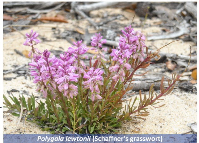
Polygala lewtonii (Schaffner's grasswort)