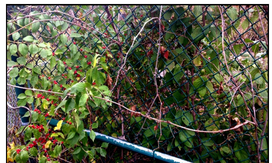
Bush honeysuckle, one of the region's most invasive species, intermingled with leatherleaf viburnum, which has only more recently begun to escape cultivation. Early detection is key.