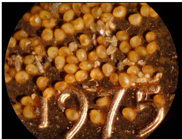
The miniscule seed of Geocarpon minimum , on top of a penny for scale. A 2014 study by Albrecht et al. found limited gene flow among geographically isolated populations of this federally threatened annual, which is restricted to sandstone outcrops and saline slicks in MO, AR, TX, and LA.