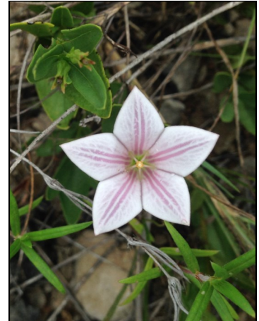
Spigelia alabamensis , one of the species endemic to Alabama’s Ketona glades, was flowering during our visit in late-July.