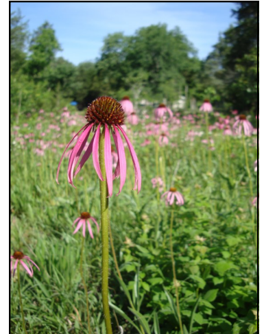
Prior to restoration, this population of Echinacea simulata had few flowering individuals due to cedar encroachment