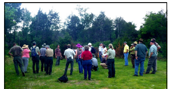
Interpreting habitat restoration and rare plant reintroduction for participants in the Mid-South prescribed fire tour and conference