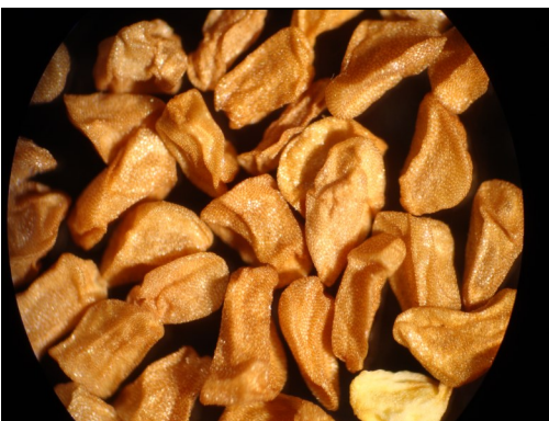
Seed of Parnassia grandifolia (grass of Parnassus)