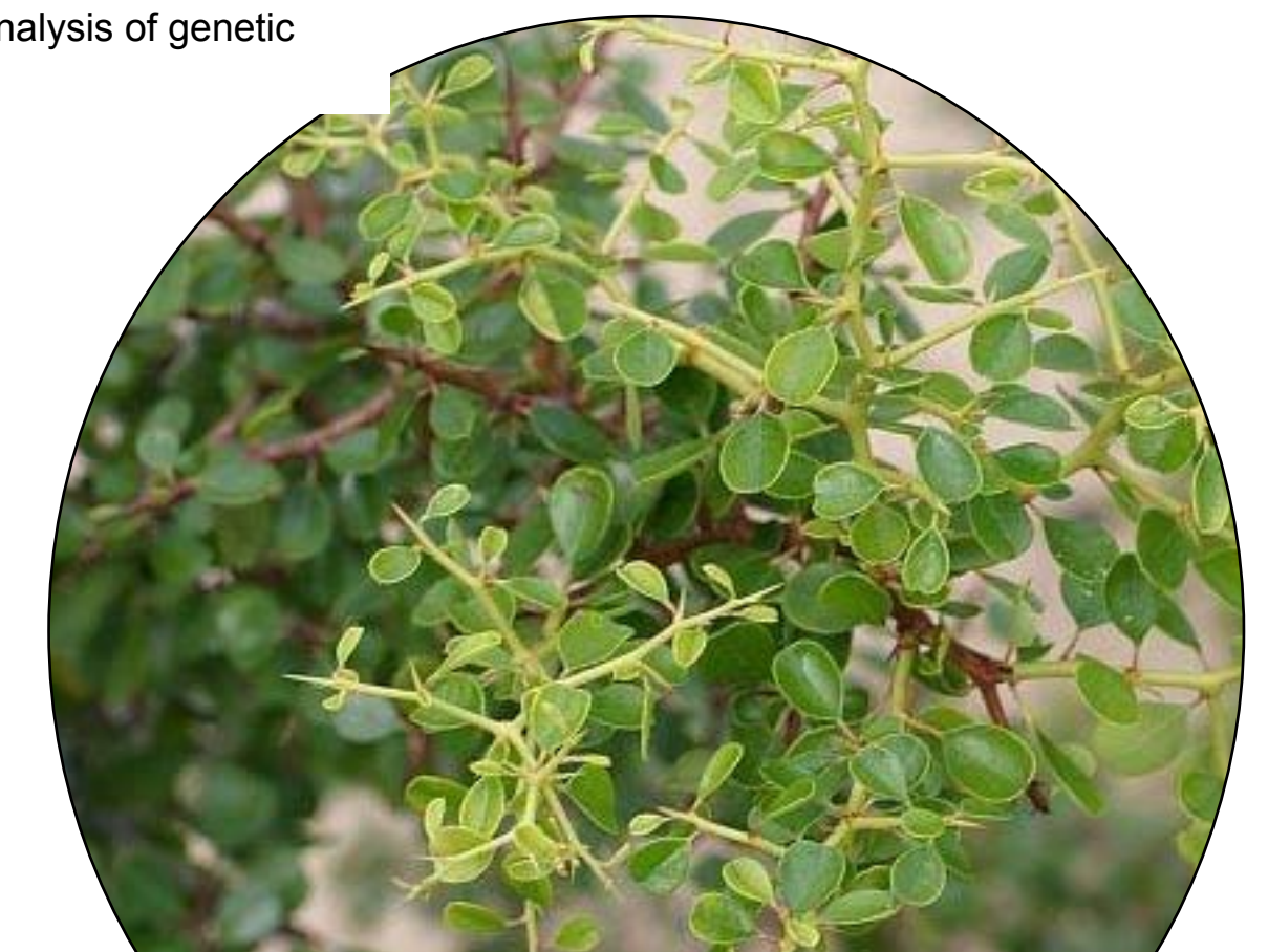
Ziziphus celata Federally endangered Collaborators: Archbold Biological Station. Funding: Florida Forest Service Methods: Microsatellite analysis of ex situ reintroductions

Abbreviations: DoD Legacy - Department of Defense Legacy Resource Management Program ESTCP - Environmental Security Technology Certification Program FDACS - Florida Department of Agriculture and Consumer Services IUCN - International Union for Conservation of Nature MBG - Missouri Botanical Garden RAD-seq - Restriction Enzyme Associated DNA sequencing USFWS - U.S. Fish and Wildlife Service