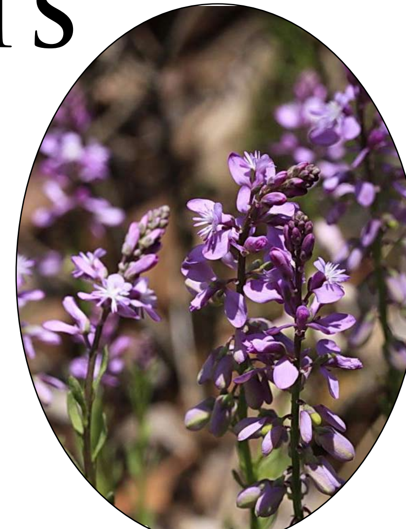
Polygala lewtonii Federally endangered Collaborators: Archbold Biological Station Funding: FDACS Methods: Microsatellite analysis of mating system