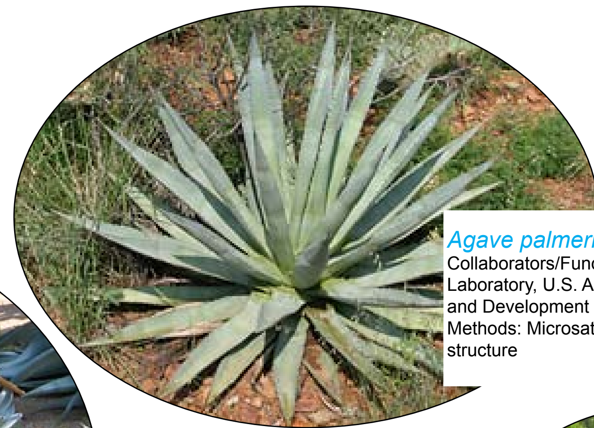
Agave palmeri Collaborators/Funding: Environmental Laboratory, U.S. Army Engineer Research and Development Center, Vicksburg, MS Methods: Microsatellite analysis of genetic structure