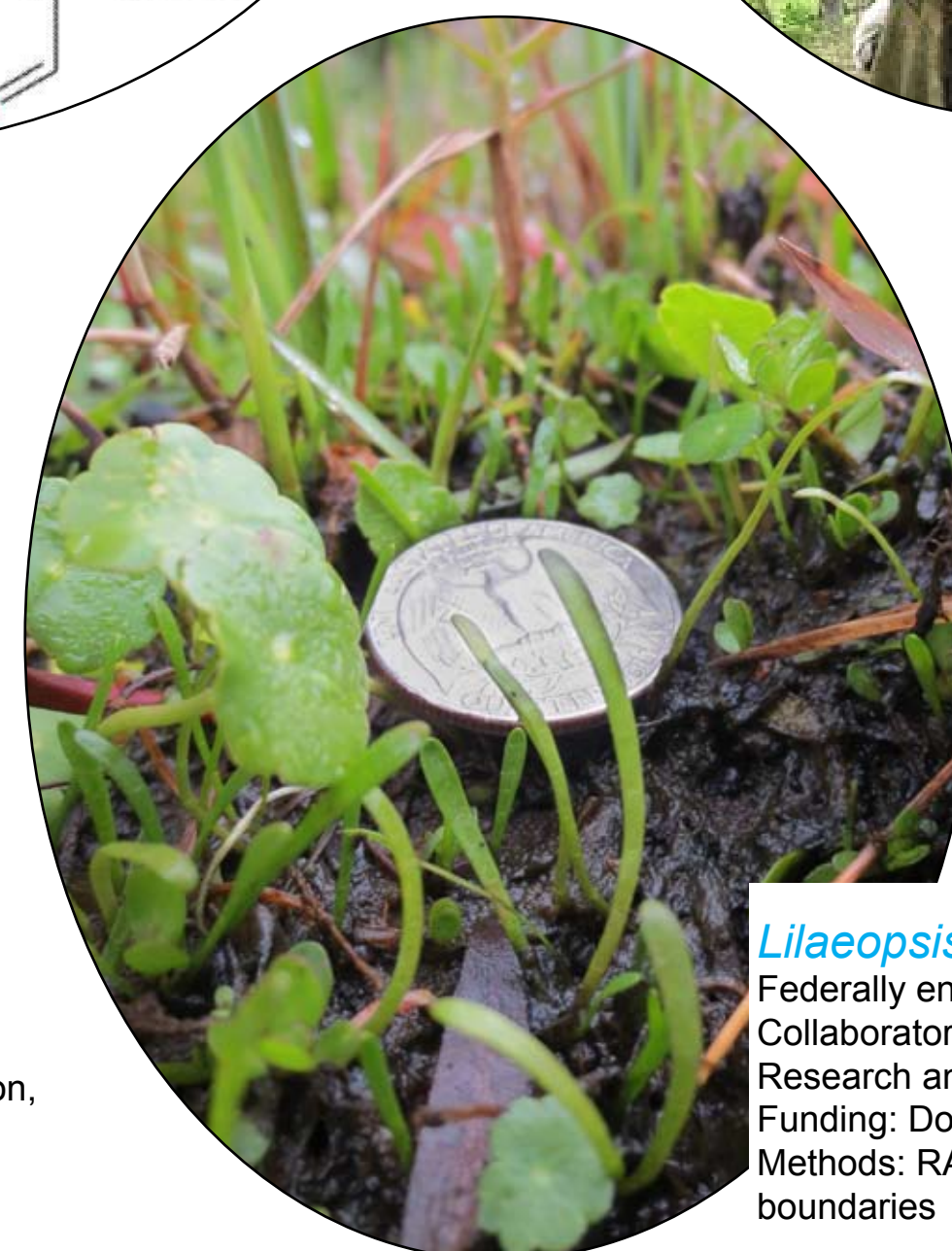
Lilaeopsis schaffneriana Federally endangered Collaborators: US Army Engineers Research and Development Center Funding: DoD Legacy Methods: RAD-seq to determine species boundaries