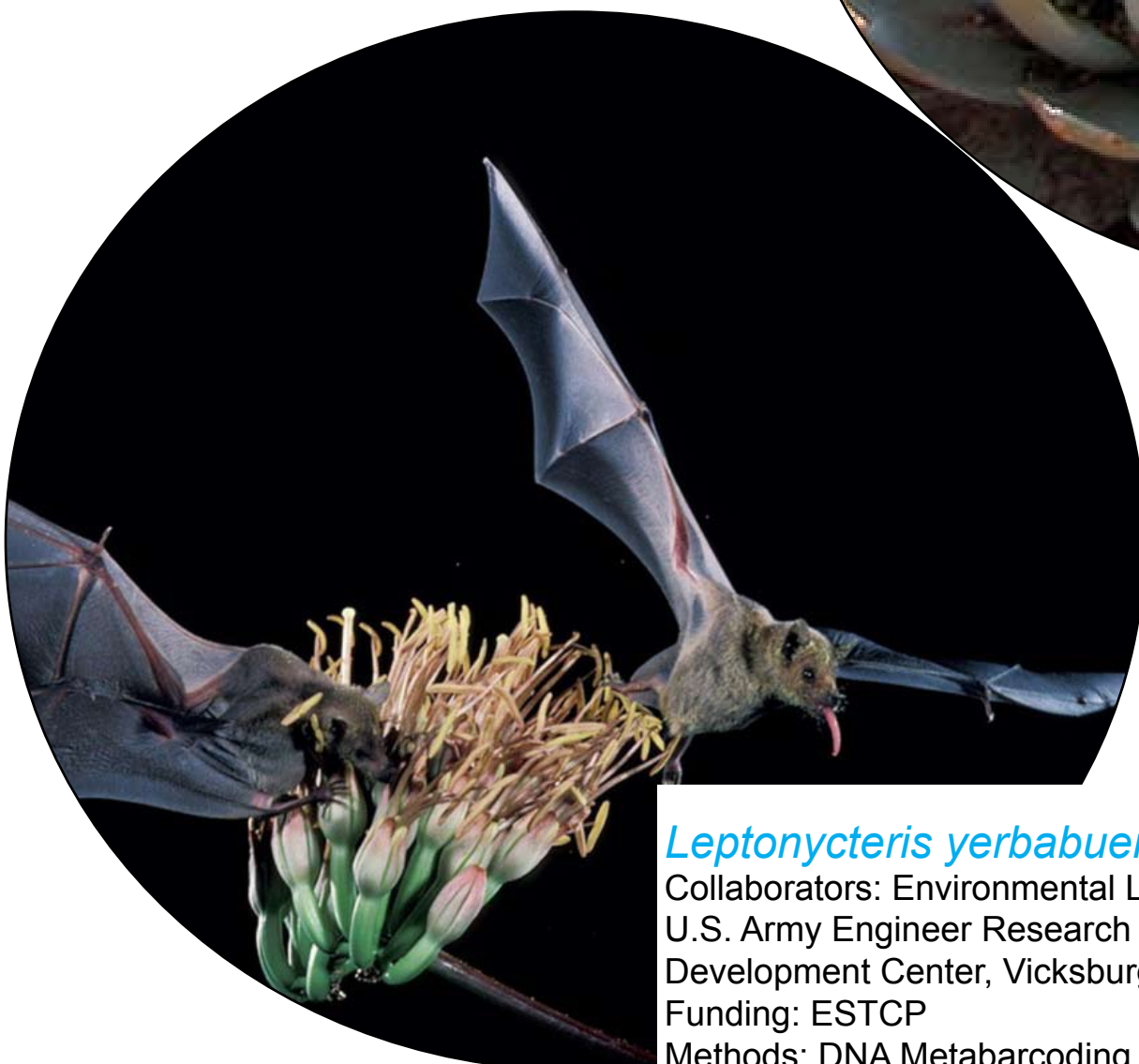
Leptonycteris yerbabuena Collaborators: Environmental Laboratory, U.S. Army Engineer Research and Development Center, Vicksburg, MS Funding: ESTCP Methods: DNA Metabarcoding of diet and parasite diversity