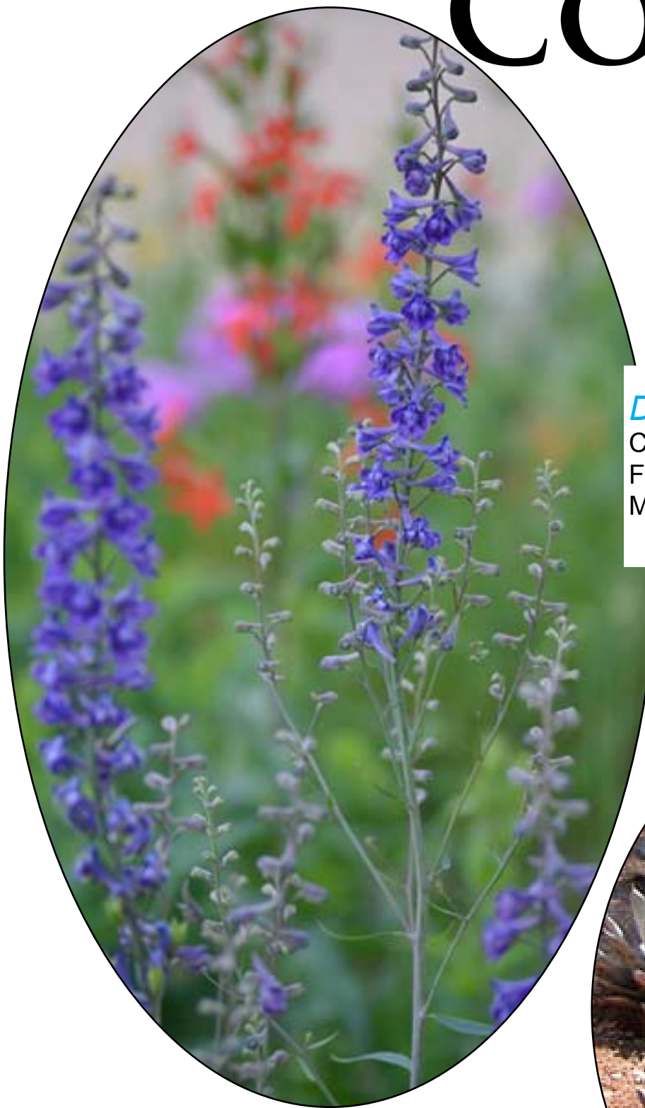
Delphinium exaltatum Collaborators: George Yatskievich (U of TX) Funding: US Park Service Methods: Microsatellite analysis of genetic structure