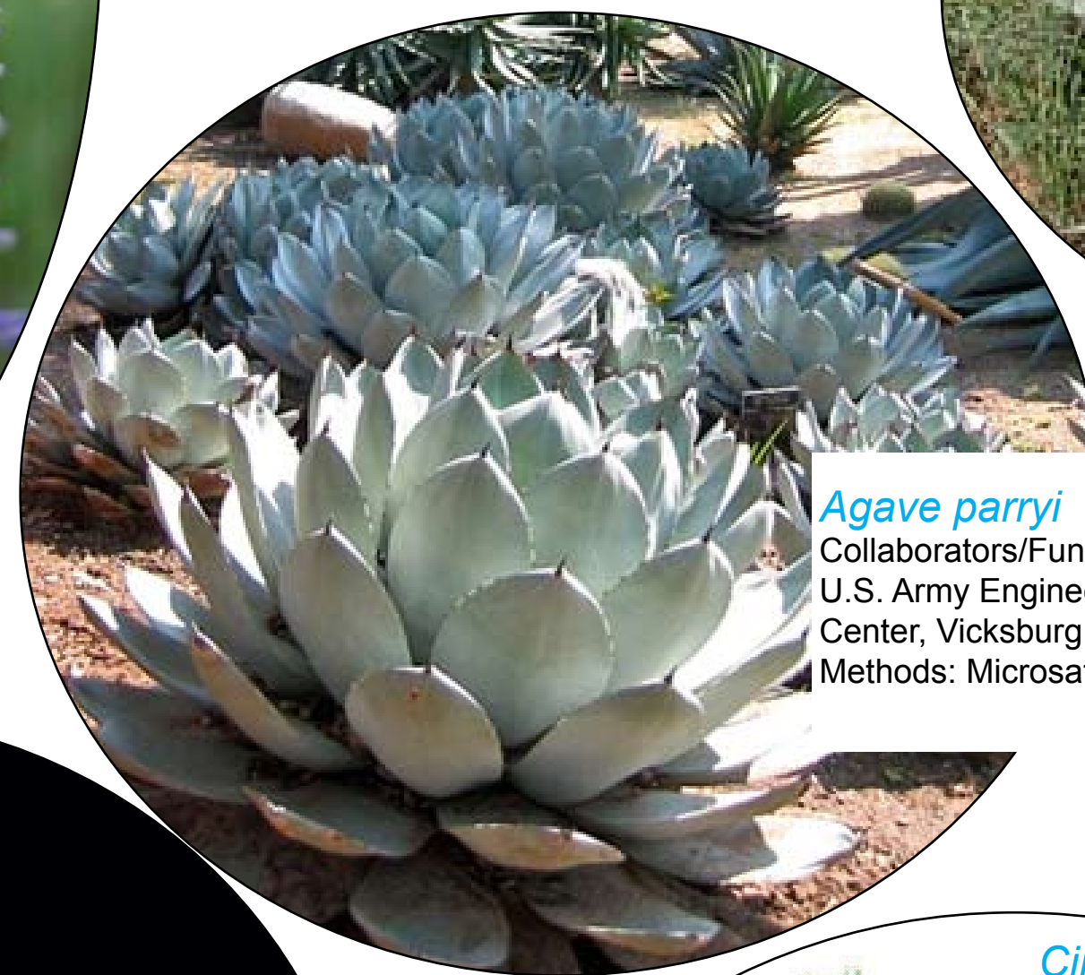
Agave parryi Collaborators/Funding: Environmental Laboratory, U.S. Army Engineer Research and Development Center, Vicksburg, MS Methods: Microsatellite analysis of genetic structure