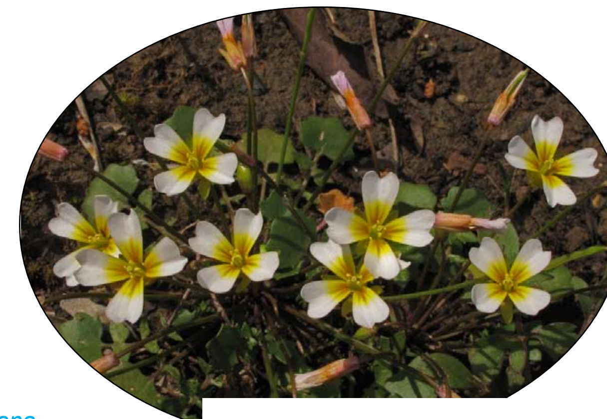
Leavenworthia exigua var. laciniata Federally threatened Collaborators/Funding: USFWS Methods: Microsatellite analysis of genetic structure