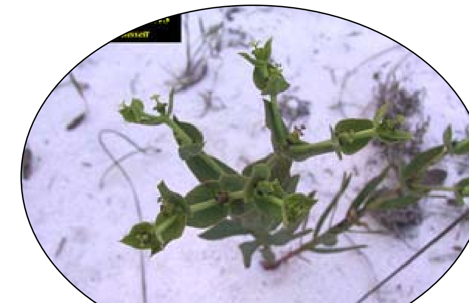
Euphorbia rorescens Federally endangered Collaborators: Archbold Biological Station Funding: FDACS Methods: Microsatellite analysis of genetic structure