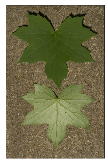
Leaf to 22 \times 20 cm.

Notes: Hydrophyllum canadense is native in Indiana.