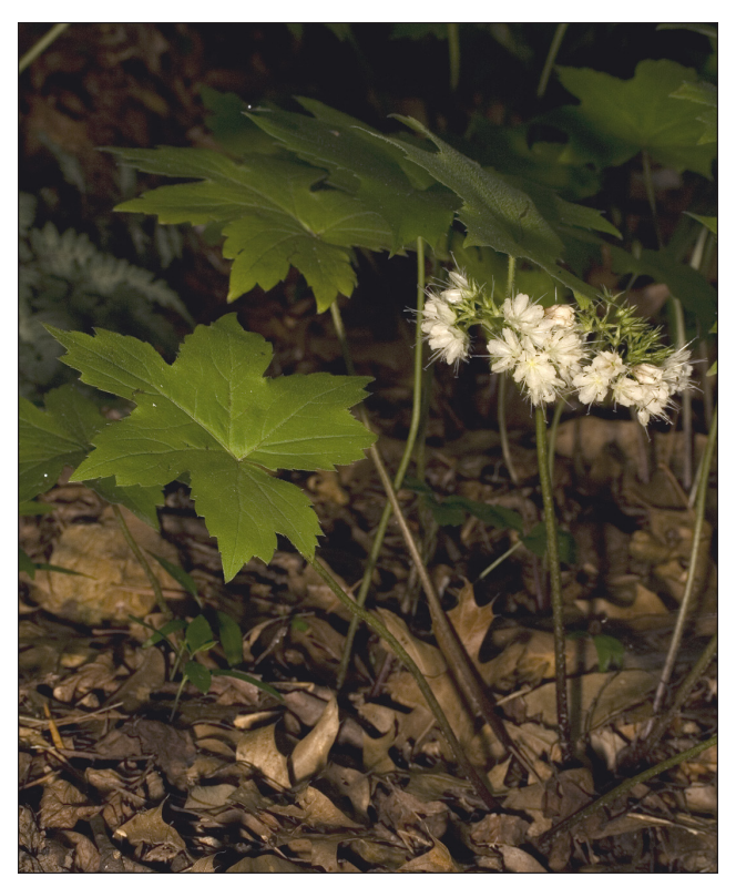
Perennial herb to 0.5 m; early leaves pinnately divided, later leaves palmately divided, about as long as wide, usually overtopping the inflorescence. Woods.

Indiana Species Pages © 3 July 2009 Kay Yatskievych • Kay.Yatskievych@mobot.org