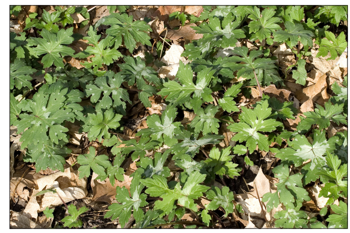
Early leaves not in a basal rosette, often extending over a large area, mostly not much longer than wide and not divided to the midvein.