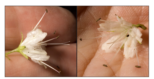
Corolla 8–12 mm long, 5-lobed to near the base, white (pinkish); calyx 5-lobed to near the base; stamens 5, exserted 3–6 mm; ovary 1, style 1(2) deeply 2-parted. Blooms June 13–July 2.