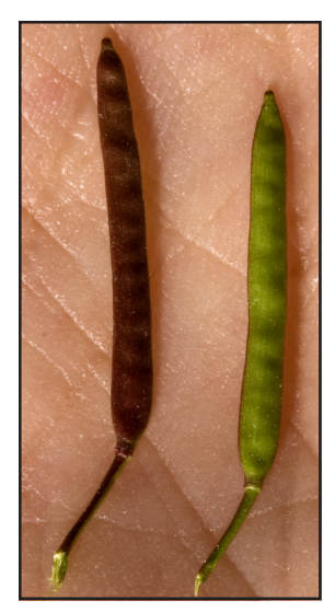
Fruit (1–)1.5–2.5(–3.2) cm \times 1–1.5 mm.