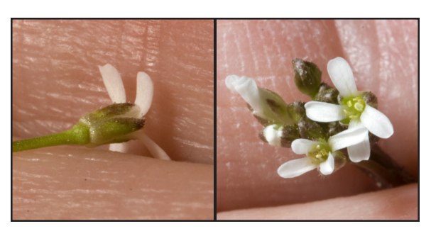
Petals 4, 2–3 mm, white; sepals 4, 1–2 mm; stamens 6; ovary 1. style 1. Blooms Mar 28–May 23.