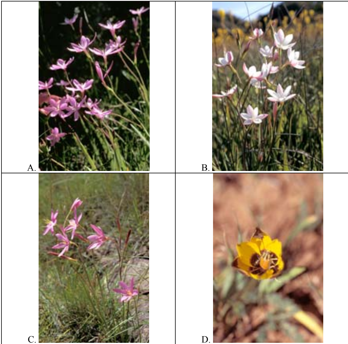
Figure 3. The principal flower types in Hesperantha . A. H. pauciflora (typical bee flower with relatively short perianth tube, pink color, and open in the day). B. H. cucullata (typical settling moth flower with relatively short perianth tube, white color with reddish pigment on outside of outer tepals, opening near sunset and lasting into the night). C. H. woodii (long-proboscisid fly flower with elongate perianth tube, pink perianth, open during the day). D. H. vaginata (beetle flower with vestigial tube, cupped perianth, brightly colored with contrasting markings, open in middle of the day) with hopliine beetle Clania glenlyonensis in the flower.