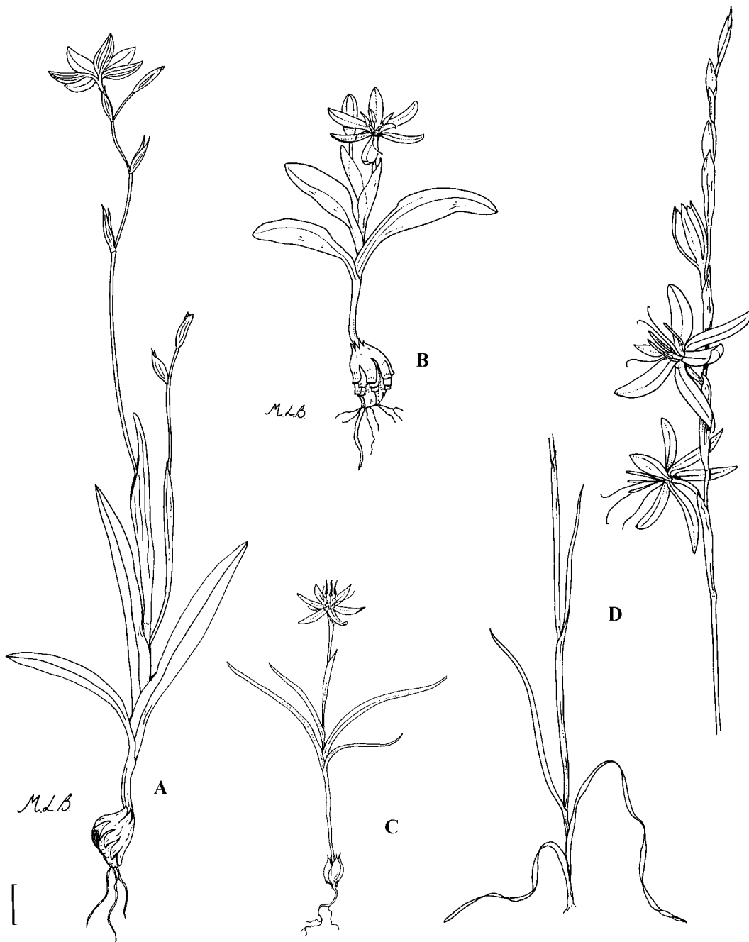
Figure 1. Growth forms and plant habit in Hesperantha . —A. H. acuta . —B. H. humilis . —C. H. oligantha . —D. H. radiata . Scale bar = 10 mm for A, B, and D; 15 mm for C. (Drawn by Margo Branch, Cape Town.)

of different populations open, some opening as early as 16:00 H, and others after 17:30 H, but in all populations we examined, the flowers remain open after 21:00 H. In H. erecta , the perianth opens at ca. 15:00 H.