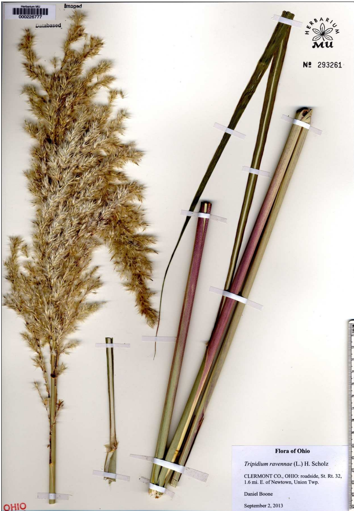
Figure 1. Characteristic specimen of Ravenna grass.