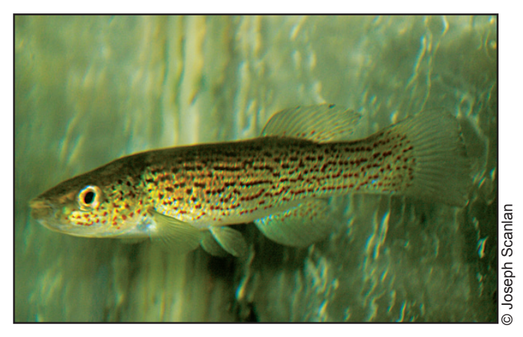
Fig. 1. A breeding male Southern Studfish ( Fundulus catenatus ) is on full display in Joseph Scanlan's tank.

While fishing in the Missouri River this fall, Louis Maring landed a whopper of a fish. The Merna, Neb. man caught what was confirmed as a new Nebraska state record. The paddlefish, which was caught Oct. 6, 2011, weighed in at 107 pounds 12 ounces. The leviathan was caught off the bank on the south side of the tailwaters of Gavins Point Dam. It was weighed on a certified scale at a local grain elevator in Yankton, S.D. The fish measured 51 3/4 inches eye-to-fork, had a girth of 39 inches, and was 74 inches in total length. Of its nearly 108-pound mass, about 40 pounds were viscera, mostly fat, and had no eggs. It had a South Dakota GFP jaw tag number PP4568. The fish was tagged June 2, 1992, below South Dakota's Fort Randall Dam. Since then it has grown 10 inches in length and added nearly 60 pounds. Nebraska Game and Parks fisheries outreach program manager Daryl Bauer believes the fish spent the past two decades living in Lewis and Clark Reservoir, which is upstream of Gavins Point Dam, prior to escaping this past summer during large releases resultant from record breaking floods on the Missouri River. Bauer estimated the fish to be about 40 years old at the time of capture.