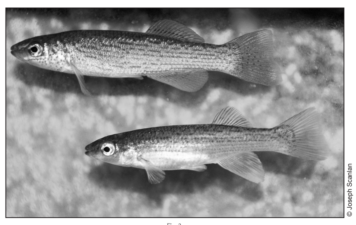
Fig. 2. A typical non-breeding male (top) and female (bottom) Northen Studfish (Fundulus catenatus).

water at the edge in order to have a successful sweep. To prevent these little leapers from escaping, a capture bucket with a good tight lid is a must.