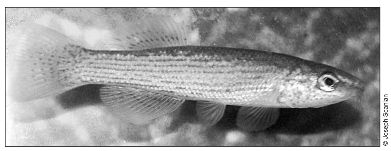
Fig. 6. A typical breeding male Northen Studfish (Fundulus catenatus).

seen many times with F. bifax, except that the male F. catenatus put more time and effort into watching the female rather than helping her clean the gravel.