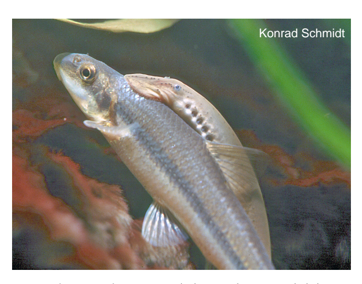
Suckermouth Minnow ( Phenacobius mirabilis ) "hosting" a Chestnut Lamprey ( Ichthyomyzon castaneus )