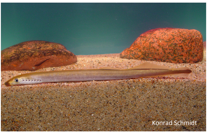
American Brook Lamprey adult