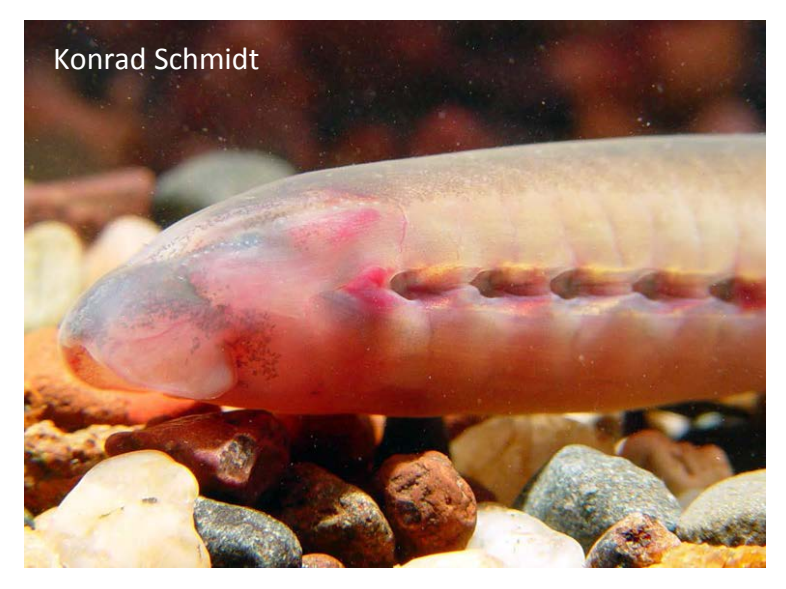
American Brook Lamprey ammocoete head