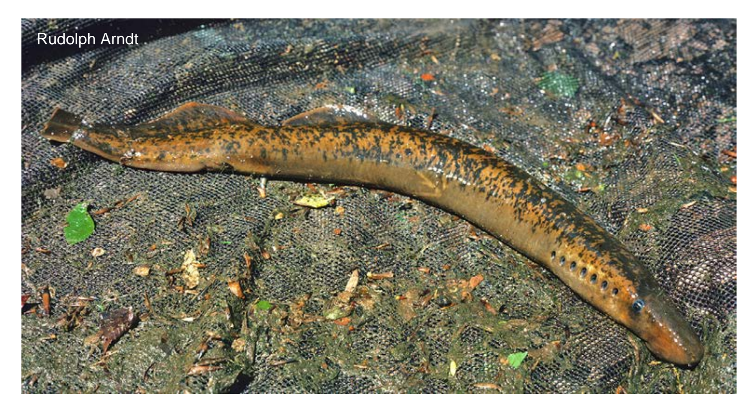
Adult Sea Lampreys