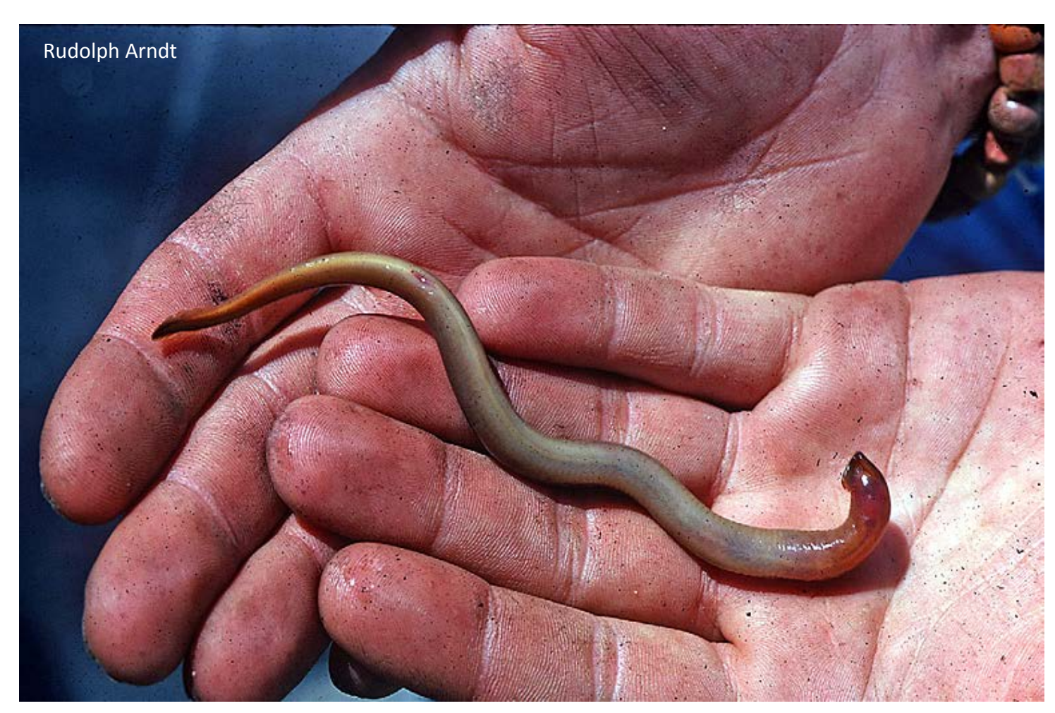
American Brook Lamprey ammocoete