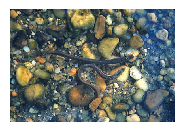
Least Brook Lamprey male/female Rudolf Arndt