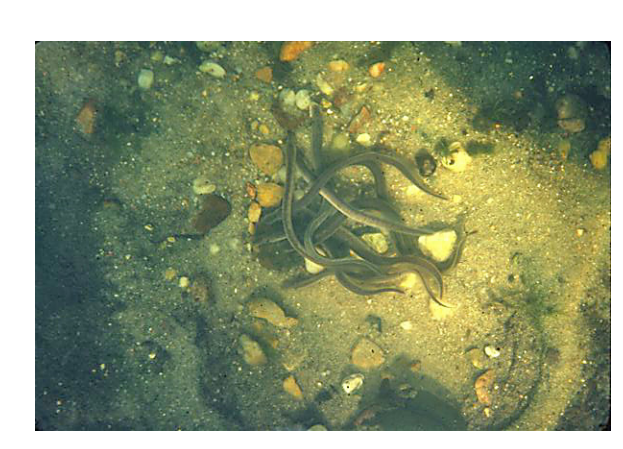
Least Brook Lampreys spawning Rudolf Arndt