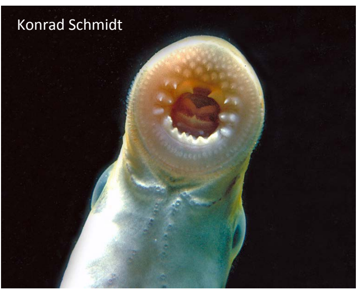
American Brook Lamprey adult disc