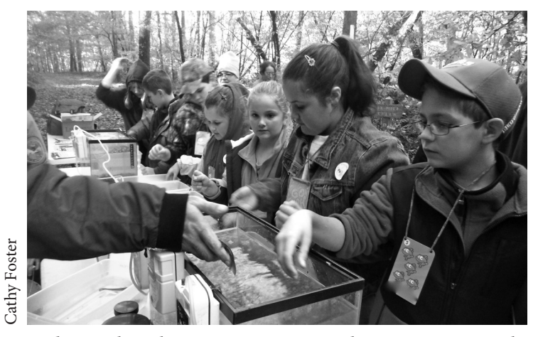
Students in the Pickens County Junior Naturalist program examine the morning's catch on the bank of Sixmile Creek in the Clemson Experimental Forest.

Reprinted with permission from the South Carolina Wildlife magazine (www.scwildlife.com) Published in the Sept/Oct 2011 issue