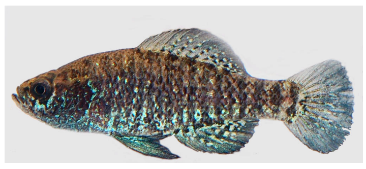
Carolina Pygmy Sunfish