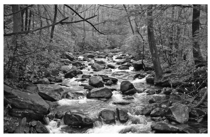
Streams in the Blue Ridge are characterized by relatively steep gradient and swift currents. They support many coldwater species.

On the bank of Sixmile Creek, the Junior Naturalists soak up a diverse world which only minutes earlier was hidden beneath the ripples of the humble stream. What began in the net as a mass of flickering fins has taken shape in two aquariums as a stunning collection of native fish: Yellowfin Shiners, Bluehead Chubs, Striped Jumprocks, Speckled Madtoms, Mottled Sculpins, Rosyface Chubs and Turquoise Darters, just to name a few. A miniature gladiator match unfolds as a crayfish tangles with a dobsonfly larva, or hellgrammite, a fearsome yet reclusive bottom-dwelling insect. Though most are small in size, these animals are part of a much larger picture. Each species has a distinct niche in the stream ecosystem and forms a critical link in the food web, converting energy into larger predators, both terrestrial and aquatic (a young Largemouth Bass lurks in the corner of one tank, sizing up a few shiners). They are valuable indicators of watershed health. Since certain species are more sensitive to changes in the environment, the fauna can say a lot about what's happening upstream — and on the land.