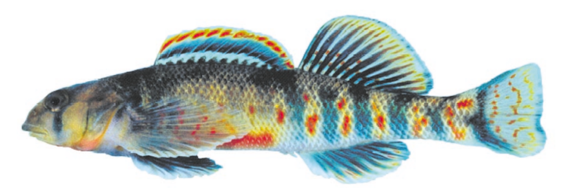
Kanawha Darter, Etheostoma kanawhae