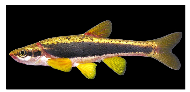
Figure 2. Blackside Dace ( Chrosomus cumberlandensis).