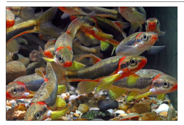
Figure 3. Blackside Dace inhabit pools with little silt and good water quality.

The Blackside Dace is a small member of the minnow family, reaching a maximum length of about three inches. It is distinguished from other fishes by its pointed snout, a wide, black lateral stripe on its side (sometimes two stripes that converge at the tail), an olive-colored to gold-colored back, and some scarlet and yellow coloration on the head and belly (Figure 2). During the breeding season, males will exhibit an intensely black stripe; bright scarlet coloration on the belly, head, and mouth; and bright yellow fins with metallic spots. The Southern Redbelly Dace ( Chrosomus eryth rogaster ) can sometimes occur in the same habitats, but it can be differentiated by its two, parallel lateral stripes.