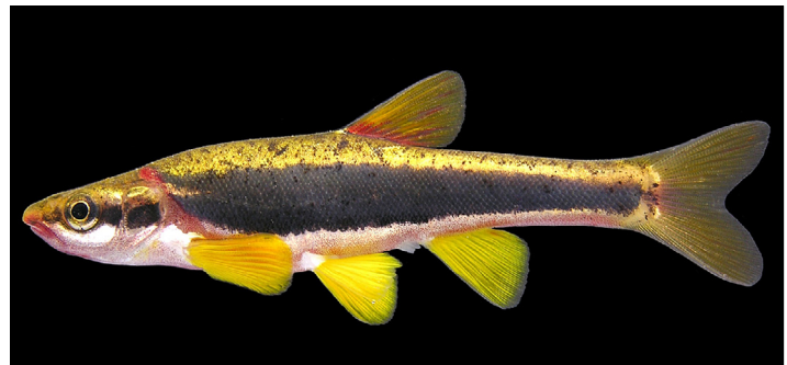
Figure 2. Blackside Dace ( Chrosomus cumberlandensis ).