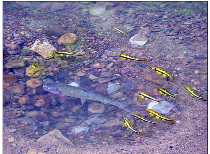
Figure 4. Blackside Dace spawning over Creek Chub nest.

When the Blackside Dace was listed in 1987, habitat loss or modification was listed as the species' primary threat. Unfortunately, these threats continue, and aquatic habitats in eastern Kentucky and Tennessee continue to be degraded chemically and physically by a variety of human activities: surface coal mining, logging, oil/gas exploration, land development, road construction, residential land use, and agriculture. Surface coal mining is often cited as the species' most significant source of threats because it is widespread within the upper Cumberland River drainage; it creates large, physically altered landscapes; and it has the potential to contribute high concentrations of dissolved metals and other solids that elevate stream conductivity, increase sulfate and hardness levels, and cause wide fluctuations in stream pH. Oil and gas exploration and drilling activities represent another significant source of harmful pollutants. A variety of chemicals (e.g., hydrochloric acid, surfactants, potassium chloride) are used during the drilling process, and these chemicals can be harmful to aquatic organisms if they leave the drill site and enter nearby waterways. Recent research has shown that Blackside Dace are less likely to be present when conductivity levels exceed 240 \mu\text{S}/\text{cm} , so the water quality threats associated with these activities are clear.