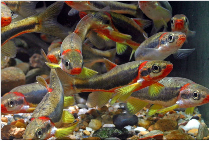
Figure 3. Blackside Dace inhabit pools with little silt and good water quality.

The Blackside Dace is a small member of the minnow family, reaching a maximum length of about three inches. It is distinguished from other fishes by its pointed snout, a wide, black lateral stripe on its side (sometimes two stripes that converge at the tail), an olive-colored to gold-colored back, and some scarlet and yellow coloration on the head and belly (Figure 2). During the breeding season, males will exhibit an intensely black stripe; bright scarlet coloration on the belly, head, and mouth; and bright yellow fins with metallic spots. The Southern Redbelly Dace ( Chrosomus erythrogaster ) can sometimes occur in the same habitats, but it can be differentiated by its two, parallel lateral stripes.