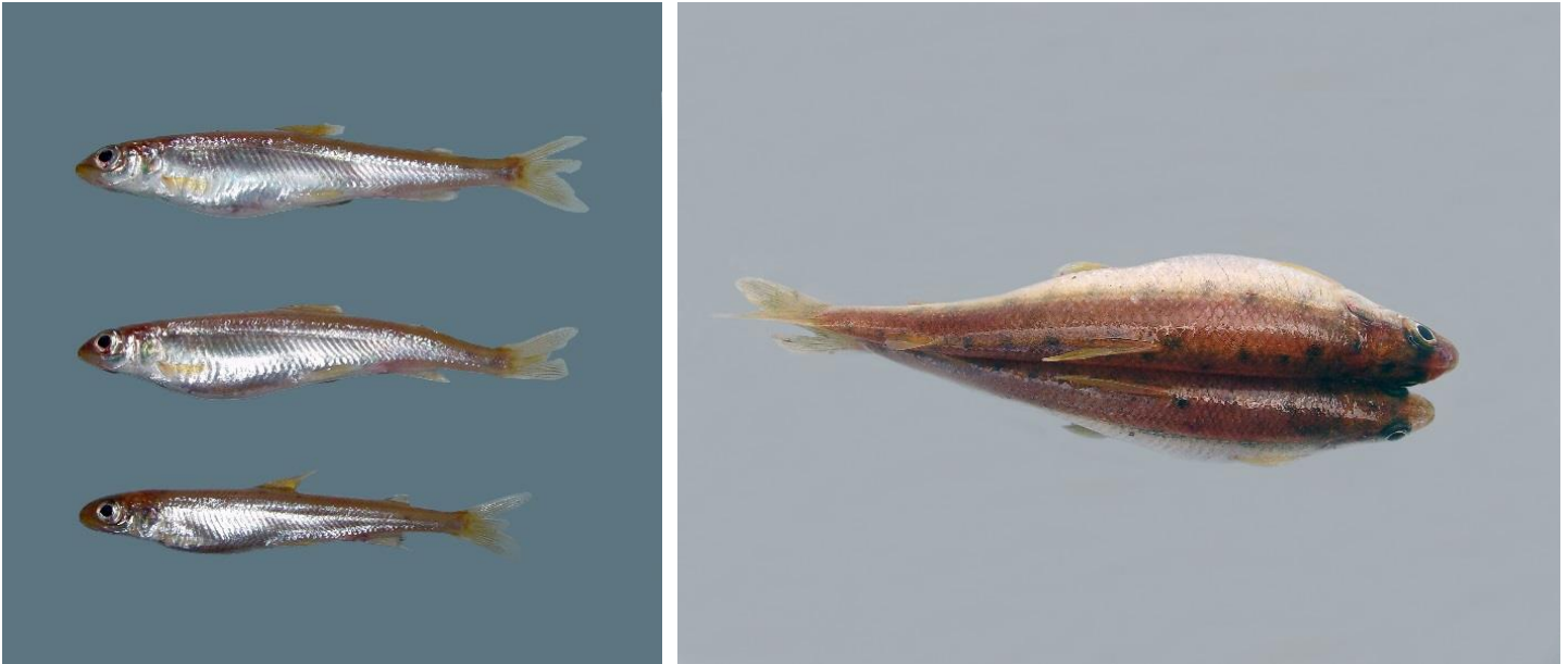
Pygmy Whitefish from Lake Superior near the Apostle Islands, Wisconsin – Konrad Schmidt

In October 2008, Paul Blanchfield and Lori Tate (Department of Fisheries and Oceans Canada) collected three Pygmy Whitefish from Winnange Lake about 35 miles east of Kenora, Ontario. The sexually mature female and two males were sampled with small-mesh bottom-set gill nets at 25-30 m (82-98 ft). One specimen was deposited in the Royal Ontario Museum fish collection in Toronto. This is the first known occurrence between Northwest populations and Lake Superior which are approximately 1100 miles apart at their nearest points (Figure 1).