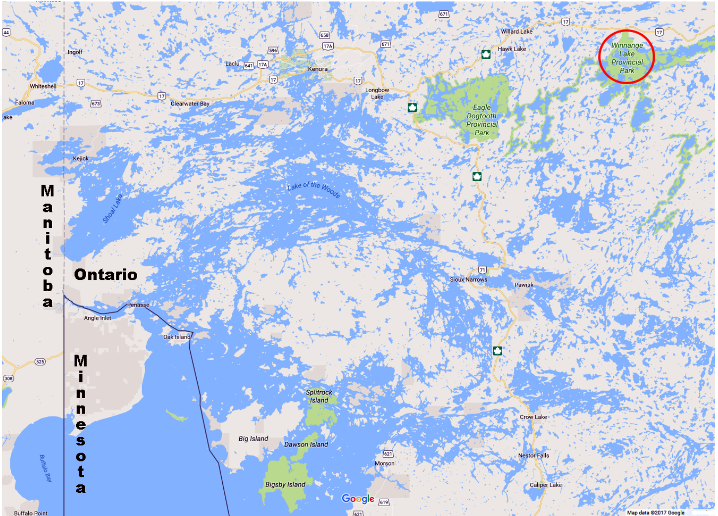
Figure 2. Winnange Lake location circled in red.

The Lake Superior population was not discovered until 1952 (Scott and Crossman 1973). Winnange Lake is approximately 200 miles northwest of Lake Superior (Figure 2). Additional surveys using small-mesh gill nets in lakes of similar size and depth may yield many new occurrences. The NatureServe website (2011) ranks the species critically imperiled in Alberta and Washington, vulnerable in Wisconsin, and apparently secure in Alaska, Yukon Territory, British Columbia, and Michigan. It has not been ranked in Ontario, Idaho, Montana, and one omission: Minnesota.