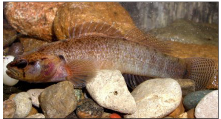
Figure 1. Male Relict Darter, breeding coloration.

The Relict Darter is known only from the Bayou du Chien drainage (Figure 3) in Fulton, Graves, and Hickman counties in far western Kentucky. Much of the Bayou du Chien mainstem and some of its tributaries have been channelized, so most of these reaches are comprised of long, straight channels with relatively uniform depth, velocity, and substrates. Some of the species' best remaining habitats are located in Jackson Creek, a tributary of Bayou du Chien and probably the least-modified stream in the watershed. Relict Darters tend to occupy