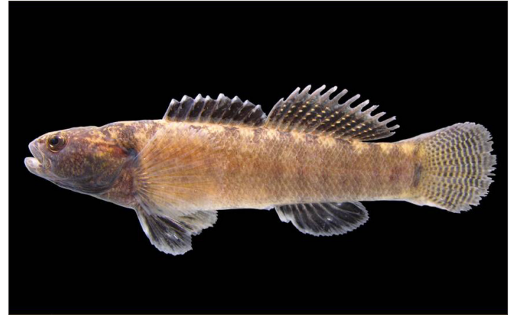
Figure 2. Male Relict Darter, non-breeding coloration.

The threats identified above continue to impact the Relict Darter, but the species is considered stable within the Bayou du Chien system. Based on recent surveys (2010-2012) conducted by the Kentucky Department of Fish and Wildlife Resources, Kentucky State Nature Preserves Commission, and the U.S. Fish and Wildlife Service (Kentucky Ecological Services Field Office), the species continues to be present at all historical sites and its current population levels are similar to previous estimates made in the 1990s. Recent estimates of mean population size were 1,526 individuals in Jackson Creek and 13,108 individuals in the Bayou du Chien mainstem. The U.S. Fish and Wildlife Service continues to implement stream and riparian habitat protection and restoration projects for the species throughout the upper Bayou du Chien system. A revised five-year status review of the species is scheduled for 2018.