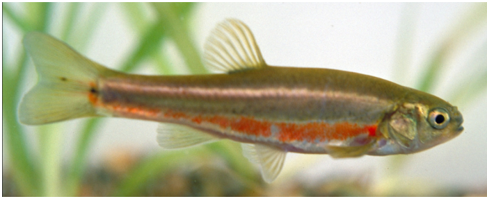
Mississippi River tributary (Dakota County, MN)