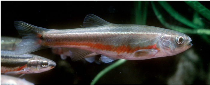
East Holden Pond (Morrison County, MN)