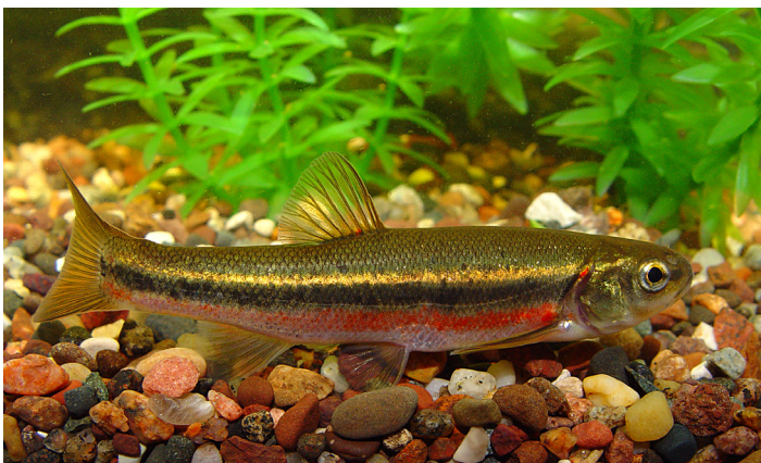
Rose Creek tributary (Mower County, MN)