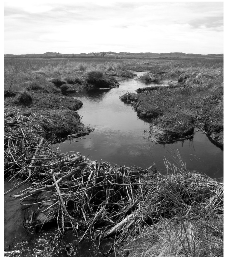
The first phase of the research identified the importance of beaver ponds for glacial relict fishes.