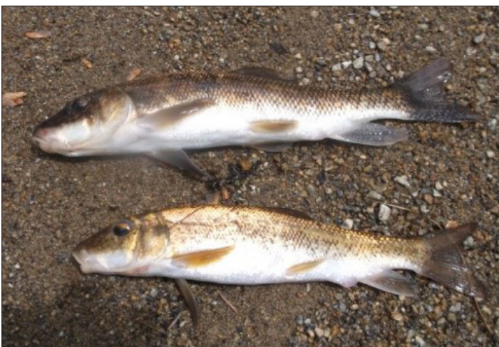
Figure 4. Elk Lake Suckers in spawning condition with tubercles, male above and female below.

Misidentifications and untested assumptions resulted in many years of overlooking these late-spawning suckers in the Adirondack Mountains. Mather (1886) did not know that he collected both Summer and Elk Lake Suckers and he did not distinguish between them. He simply stated that they were not White Suckers and he proceeded to describe