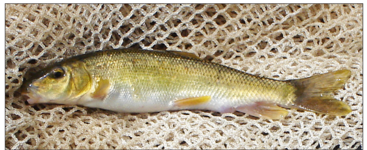
Figure 1. Summer Sucker from a headwater pond in Hamilton County on June 20, 2007, female in spawning condition.

Mather's other collection of late-spawning, small suckers is from Minnow Pond near Blue Mountain Lake, located in the central Adirondack Mountains. Current evidence suggests that this collection is part of a lineage of suckers now best known from locations 60 miles east in Elk Lake (Figure