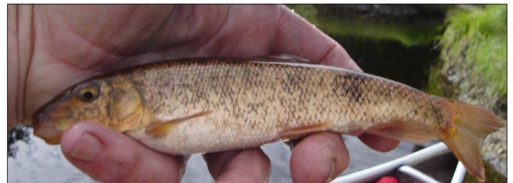
Figure 2. Oswegatchie River tributary in St. Lawrence County with Summer Sucker in running ripe condition, male, on rock May 27, 2014, and with female running ripe with eggs on June 7, 2009.