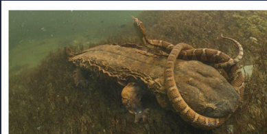
Hellbenders, aka Devil Dogs or Snot Otters, are also found in the Hiwassee River. The clean water, large flat stones and an abundance of crayfish provides an excellent watery world for them to live in. If you were to spend a day here you may well see one, especially in the early dawn or dusk hours as they are generally nocturnal hunters. They breathe through the folds of skin running down their sides and remain in the water year round. Some people are afraid of them but you have nothing to fear. They are not venomous as some unknowing people claim. Consider yourself very fortunate to see a Hellbender in one of the few remaining rivers they still thrive in. They are North America's largest salamander reaching lengths of 24 inches or more.

NANFA receives a donation for each copy sold through http://www.nanfa.org/cart.shtml#guide