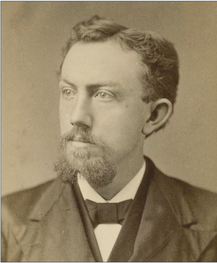
Figure 3. David Starr Jordan in 1880, the year the third edition of his Manual of the Vertebrates of the Northern United States was published.