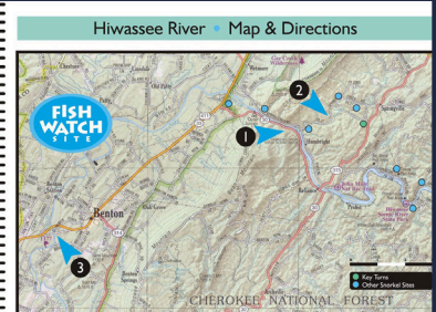
The Hiwassee River is only 30 minutes from the Conasauga River, via US Highway 411 north. A convenient location is the Hiwassee Pkwy. Site and it's just a few miles from 411, along TN 30 east toward Reliance. The picnic site offers tables, an access ramp, a restroom and a shallow grill bar to waste out from. Be careful here as the water can dramatically and dangerously rise during power generation surges. While in Reliance, visit the historic Webb Brothers general store and post office. On the other side of the river, at the bridge, is a fly fishing store and deli as well. Free camping is available along Spring Creek and paid camping with facilities at Gee Creek Campground. A visitor center is nearby. The Hiwassee River Picnic Site.