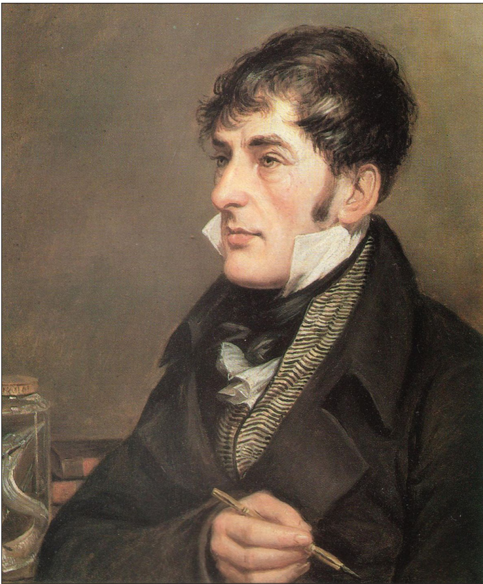
Figure 2. Charles Alexandre Lesueur in 1818, oil portrait by Charles Willson Peale. Note the eel (perhaps Anguilla rostrata ) in the jar.

Lesueur's description of P. natalis is poorly done by today's standards and does not appear to provide a truly differentiating character. Not helping matters is the fact that no type specimens survive, preventing one from examining the same fish that Lesueur had before him in 1819. Nevertheless, the name Pimelodus natalis became established in the literature, eventually becoming Amiurus (correctly Ameiurus ) natalis when Theodore Gill revised the North American catfishes in 1861. Since it is important to note the presence or absence of specific anatomical features in Lesueur's description, it is useful to provide an accurate English translation here: