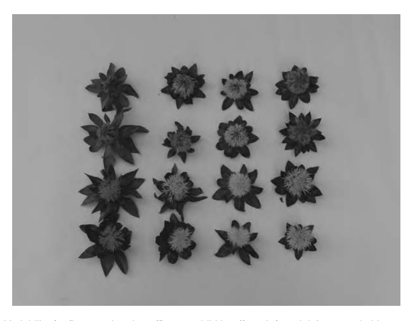
Figure 6.2 Variability for flower colour in safflower exhibiting (from left to right) orange in bloom turning to dark red on drying (O-dark red); yellow in bloom turning to yellow on drying (Y-Y); white in bloom turning to white on drying (W-W); yellow in bloom turning to red on drying (Y-R).