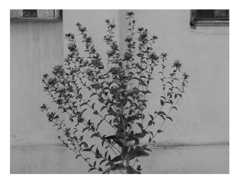
Figure 6.1 Single plant showing primary, secondary, and tertiary heads.