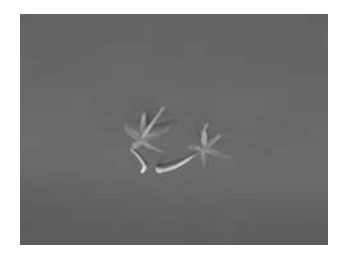
Figure 6.4 Safflower florets showing petals, stigma, anther, carolla tube, and ovary.

flower develops into a single-seeded fruit called an achene, which is commonly known as seed. The pollen of safflower is yellow. Pollination occurs as the style and stigma protrude out of the fused anther tube. Unpollinated stigma remains receptive for several days. Outcrossing in safflower has been reported to range from 0 to as high as 59% in different genotypes in India (Patil et al., 1987). The outcrossing in genetic male-sterile lines in safflower is reported to be 100%, as no difference in seed yield of male-sterile and male-fertile plants under open pollination was observed (Singh, 1996). Safflower pollen is transferred by insects and not by wind. The most prevalent pollinator agent in safflower is honey bees. Bees visit the safflower flowers for both pollen and nectar. Each safflower capitulum produces 15 to 60 seeds.