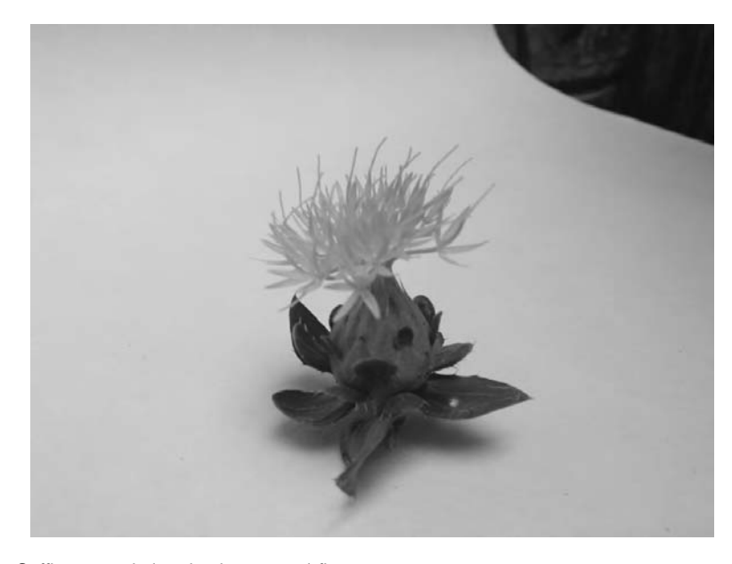
Figure 6.3 Safflower capitulum having several flowers.

Figure 6.2 Variability for flower colour in safflower exhibiting (from left to right) orange in bloom turning to dark red on drying (O-dark red); yellow in bloom turning to yellow on drying (Y-Y); white in bloom turning to white on drying (W-W); yellow in bloom turning to red on drying (Y-R).