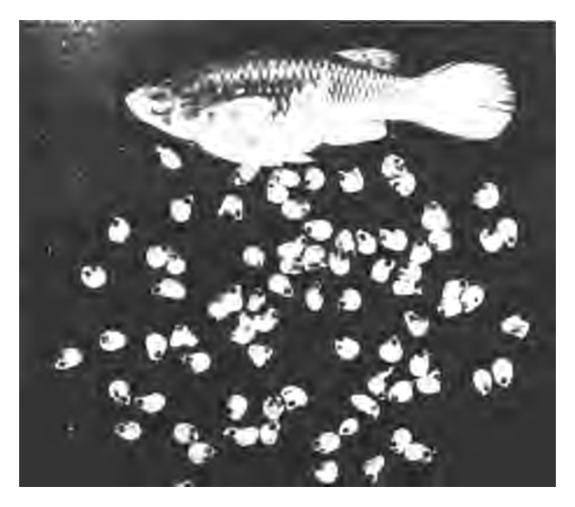
Figure 1.—Pregnant female Gambusta affinis affinis . The brood of 79 embryos were removed later. The yolk sac has been completely absorbed, and the embryos are nearly fully developed and about ready for birth.

Growth of mosquitofish is rapid, depending on the food supply and to a lesser extent on the water temperature.