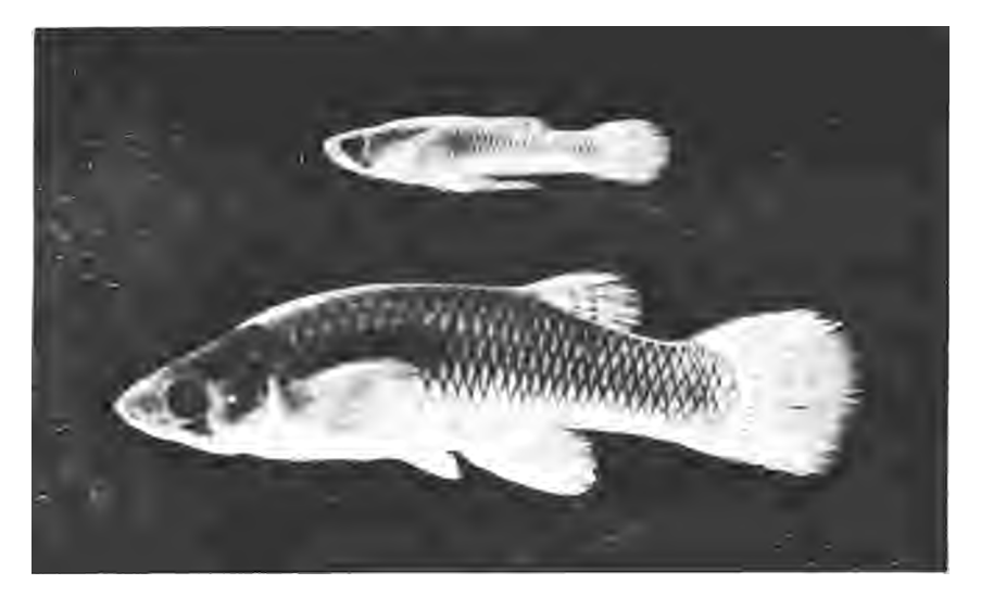
Adult male (above) and adult female (below) Gambusia affinis affinis.

UNITED STATES DEPARTMENT OF THE INTERIOR FISH AND WILDLIFE SERVICE BUREAU OF COMMERCIAL FISHERIES Fishery Leaflet 525