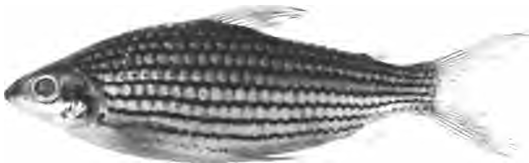
Fig. 2. Cyphocharax multilineatus , USNM 269987, 111.8 mm SL; Venezuela, Territorio Federal Amazonas, Departamento Rio Negro, Caño Tremblador where crossed by road from San Carlos de Río Negro to Solano.

rina fasciata (Fig. 3), an endemic of the Rio Madeira basin, and have lead to misidentifications of the two species. Cyphocharax pantostictos lacks the derived features that diagnose Steindachnerina (see Vari 1989a: 58, 1990), and lacks the intrageneric synapomorphies for the clades that include S. fasciata (see Vari 1990 for details). One of the most obvious differences between the two species involves the form of the buccopharyngeal complex on the roof of the oral cavity. Cyphocharax pantostictos has three simple longitudinal fleshy folds in that region. Steindachnerina fasciata , in contrast, has a mass of lobulate fleshy bodies that extend ventrally into the oral cavity, a hypothesized derived condition unique to a