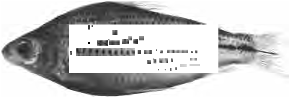
Fig. 3. Steindachnerina fasciata , MNRJ 11208, 89.6 mm SL, holotype of Curimata fasciata Vari and Géry; Brazil, Território de Rondônia, Município de Ouro Preto do Oeste, Rio Romari (or São Domingo) near Nova União.

subunit of Steindachnerina (see Vari 1989a: 31-35, 1990, for a discussion of the buccopharyngeal complex).